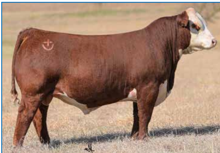
SHF HOUSTON D287 H086 — SIRE OF LOT 7