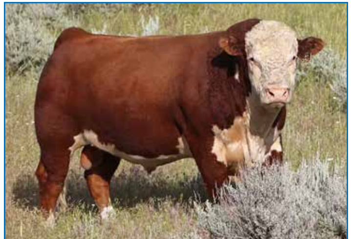
NJW 73S 78W RIDGE 103C ET — FEATURED AI SIRE FOR LOT 23