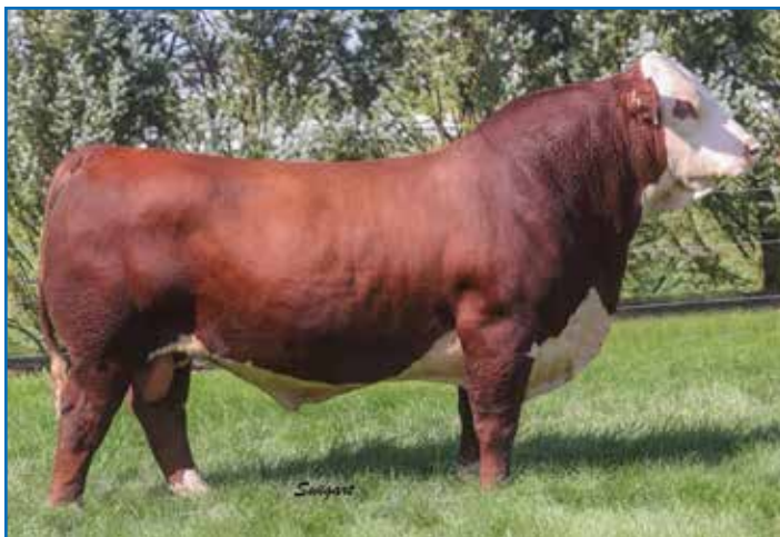
BOYD 76E FORECAST 0050 — SIRE OF LOT 13