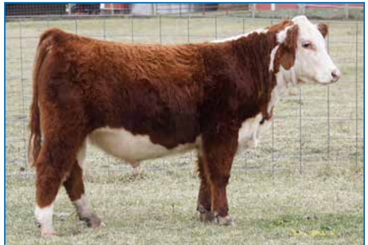
LOT 6 — CHF 0100 DELIVERANCE 4026