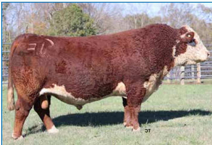
NJW 202C 173D STEADFAST 156J ET — SIRE OF LOT 8