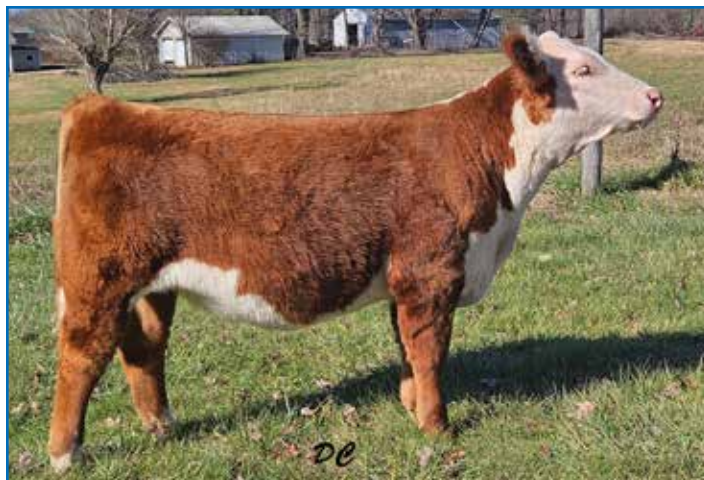
LOT 26 — PF QUEEN 02M