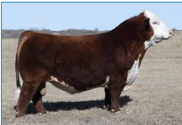
BK RED RIVER H18 ET — SIRE OF LOT 3