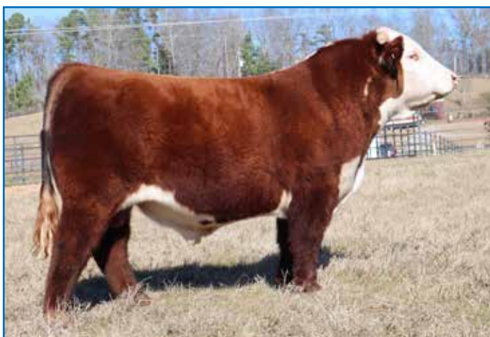
DCF 6018 BELLE HEIR J41 ET — SIRE OF LOT 15