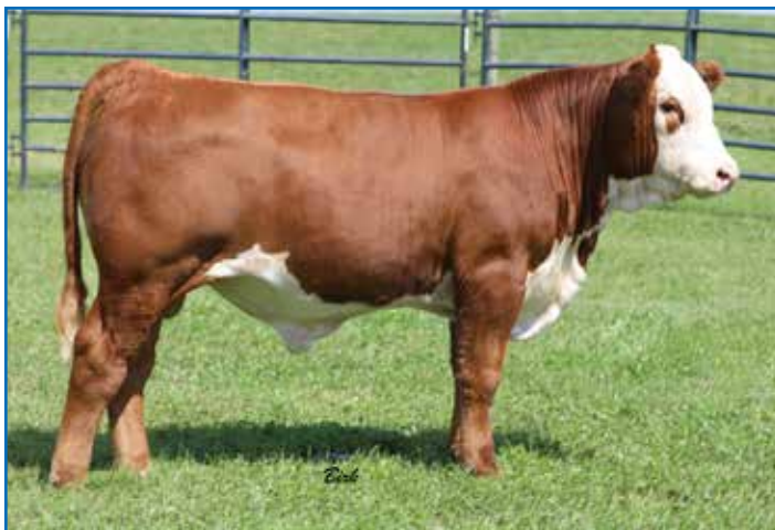
JLCS 15G UNDERGROUND K10 — SIRE OF LOT 14