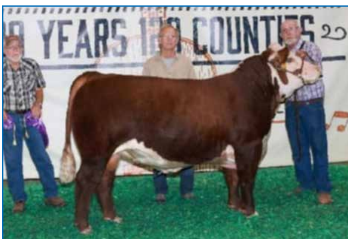
LOT 21 — JC B413 BOLD RULER 49ZL