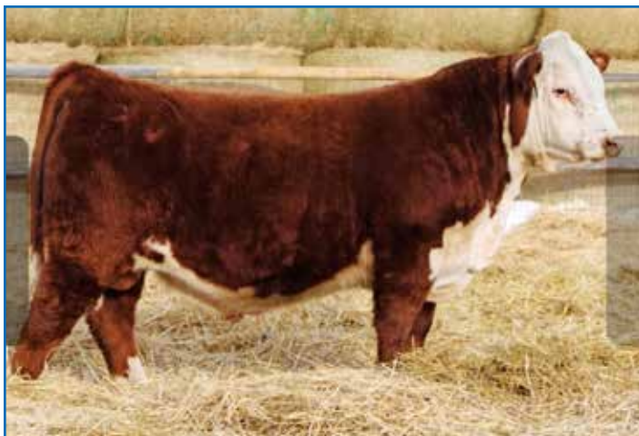
BECKLEY 72C HEAVY DUTY 1031 — SIRE OF LOTS 1-2