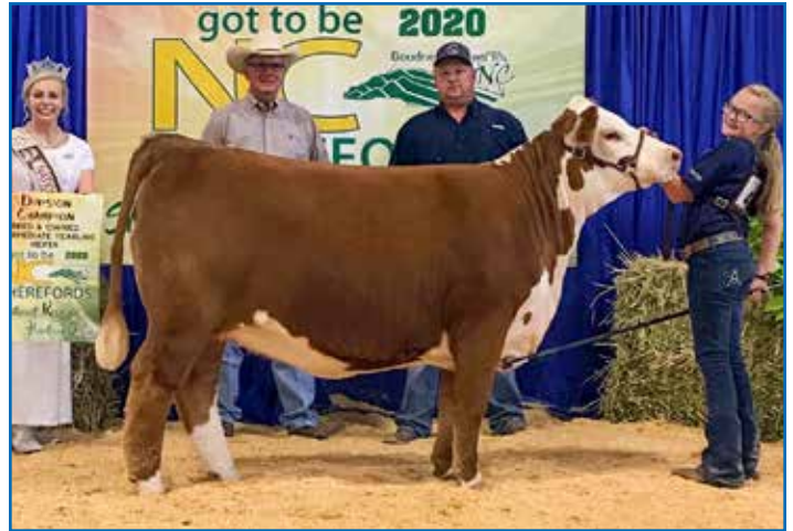
MCS MISS LONDON 901 — DAM OF LOT 16