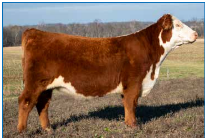
LOT 12 — LLH 018J PENELOPE 2309