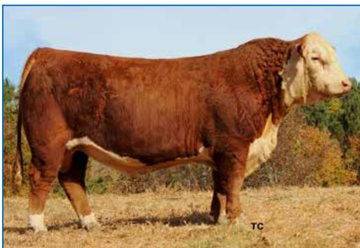
INNISFAIL WHR X651/723 4013 ET — GRANDSIRE OF LOT 9