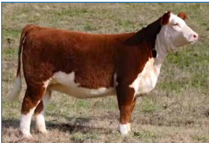
LOT 1 — KATYS LILY L612