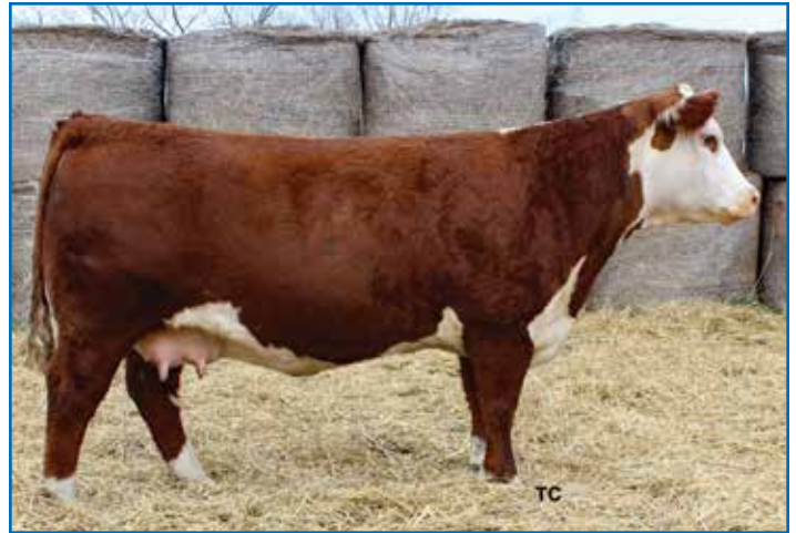
NJW 6W 80X STELLA 95Z — GRANDAM OF LOT 4