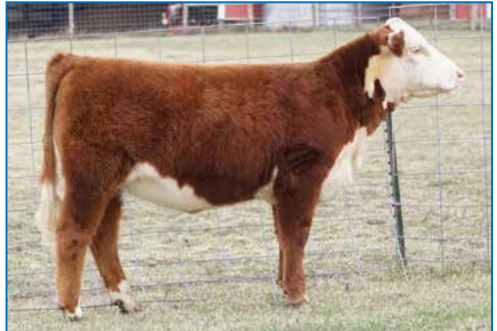
LOT 5 — CHF D87 IMAGE 4080 ET