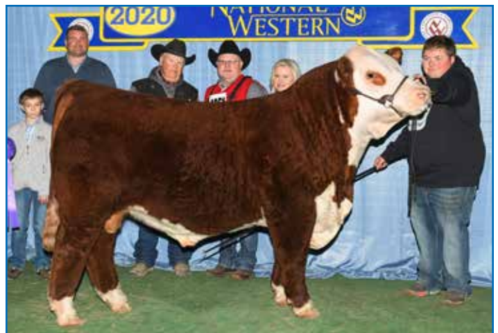
BOYD 5301 ENGINEER 8126 — GREAT GRANDSIRE OF LOT 18