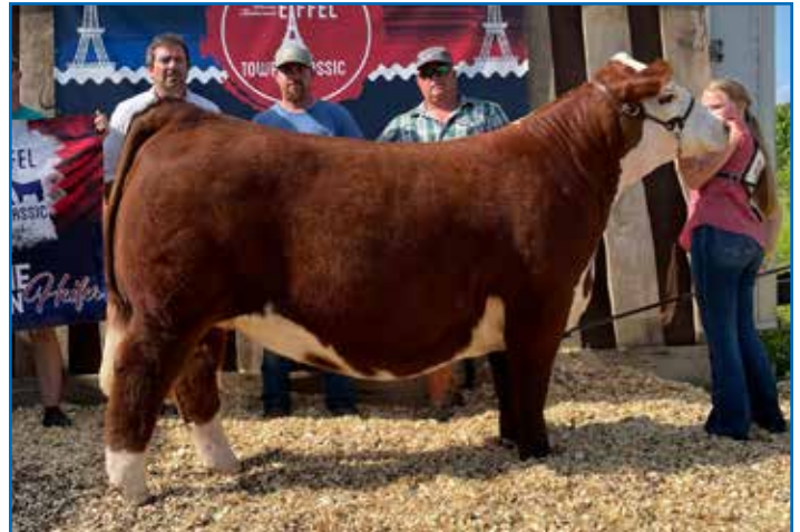
YB EMMA 860 030 — DAM OF LOT 17