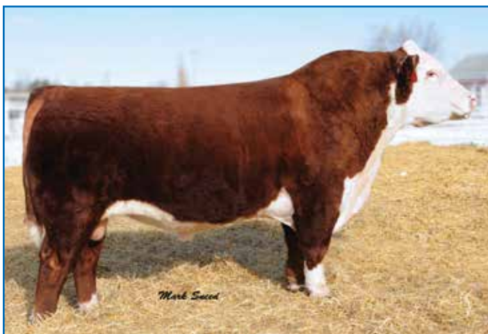
MSU TCF REVOLUTION 4R — SIRE OF LOT 20