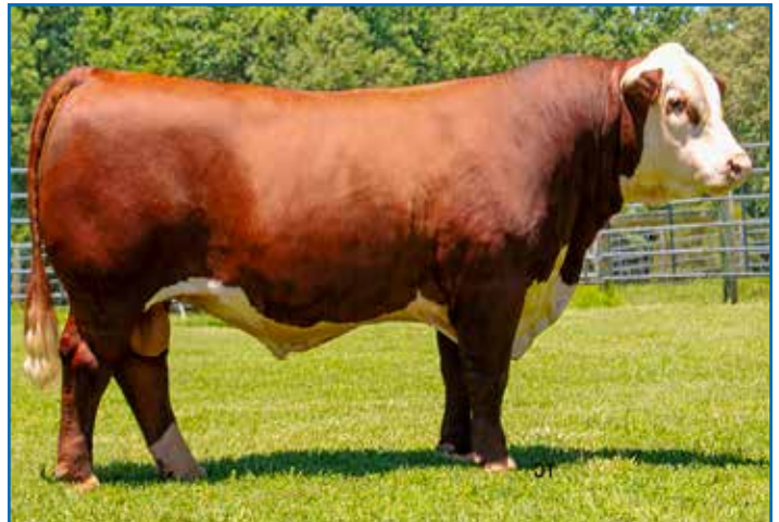
WF CLC WILD CARD 76E 2505ET