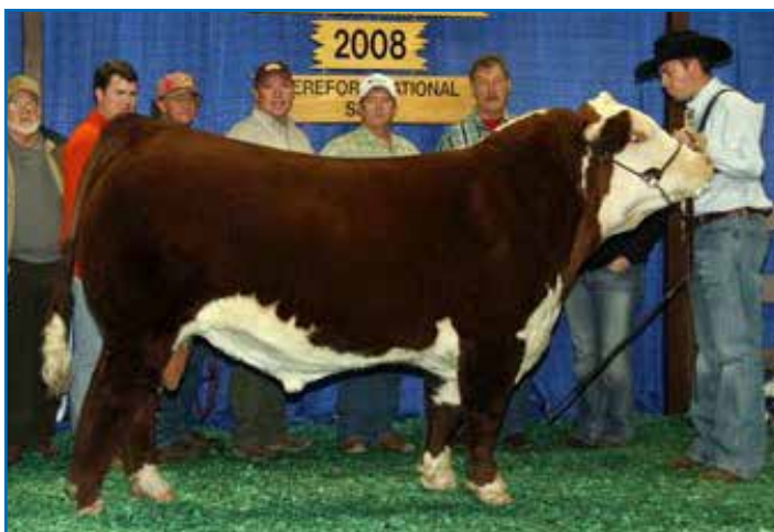
TAN WSF HCC 106G 47N BOLD 742T ET — SIRE OF LOT 19