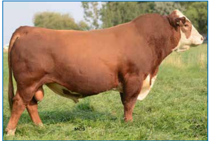
/S MANDATE 66589 ET — SIRE OF LOT 22