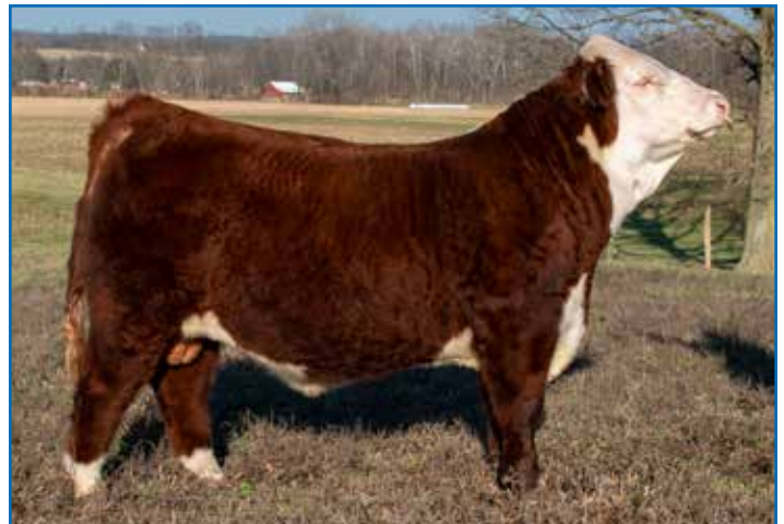
LOT 11 — GKH 42J LADY'S FIRST 2400