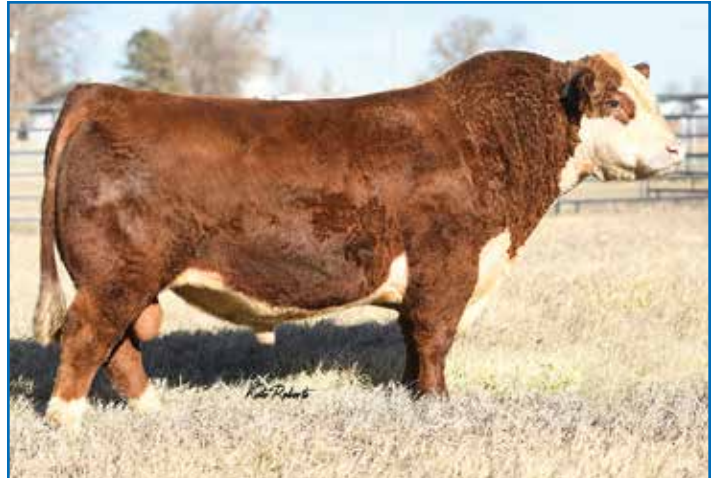
BOYD 31Z BLUEPRINT 6153