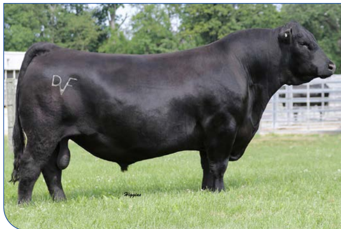
Deer Valley Growth Fund - Sire of Lot 9