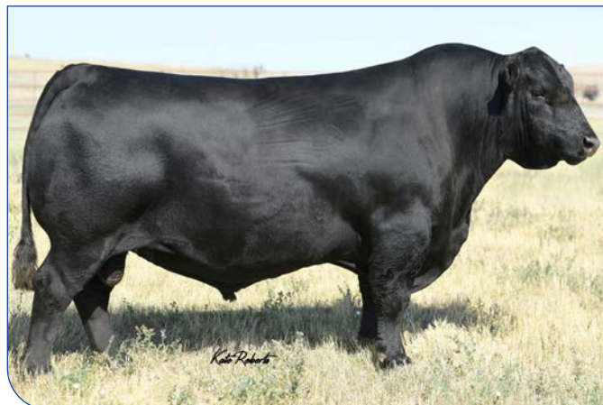
KCF Bennett Summation - Sire of Lot 28