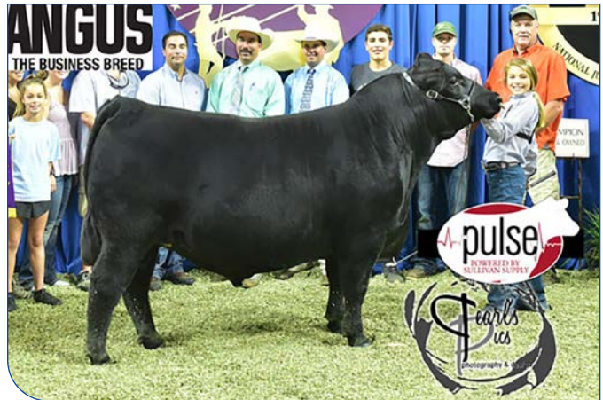
3 Aces Wildcat 1507 - Sire of Lots 16 & 17

Here is another exceptional daughter of PHF Provost 9032, going back to SAV Blackcap May 4136, the world-record income-producing cow at Schaff Angus Valley. Stemming back to the Elba and Forever Lady cow families, this young female is sure to be a profit-making investment for years to come. She is long bodied with such an attractive clean front end. This jewel has potential to be competitive in the showing and no doubt will become an easy-keeping brood cow in the pasture field after her show career is over. Don't pass her up in the stalls on sale day! Breeding information will be available on sale day.