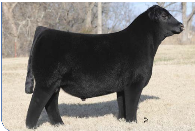
Conley No Limit - Sire of Lot 4

• A fancy show prospect out of PVF Blacklist, the sire of many champions. Her dam by Silveiras Style was purchased in a previous Sweepstakes from Kelley Flanders and traces back to Dameron First Class. 967 has both style and balance with a sweet disposition. Check out her EPDs before sale day. Genomic testing done.