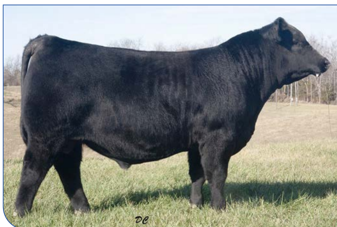
CF Cadillac 2205 - Lot 35