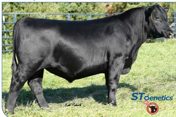
Beal Breakthrough - Sire of Lot 14