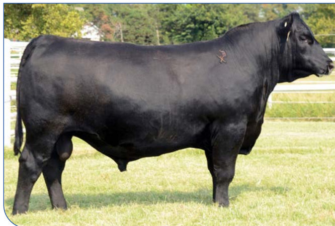
EXAR Stud 4658B - Sire of Lot 32