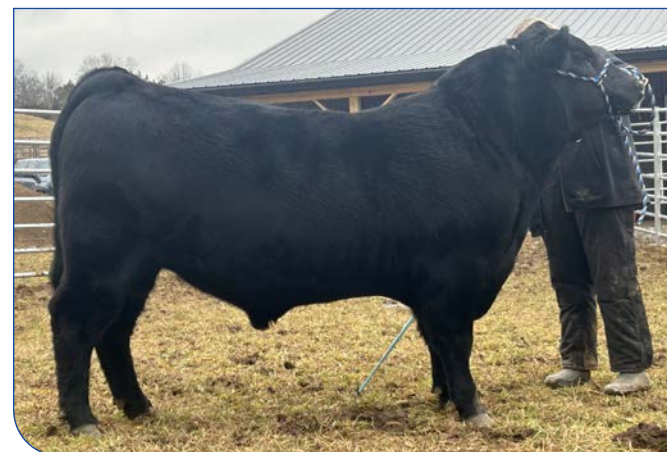
LCF Veracious 2202 - Lot 38

Awsome herd sire prospect being offered by Low Water Farms. This stout son of the popular select sires roster member HPCA Veracious has been a many-time champion for Annaliese. His dam carries proven cow families in her pedigree, such as Sandpoint Blackbird 8809, GAR Objective 1885, and Deer Valley Blackcap 1122. The combination of top maternal EPDs and chart-topping carcass numbers are sure to add high-caliber genotype and phenotype cattle in your next calf crop. Don't miss the opportunity to own an outstanding young sire with the pedigree, EPDs and look to make an impact in your herd.