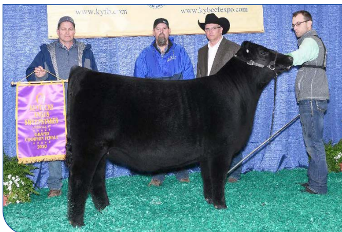
Flushmate to Johnson Missie 845, Dam of Lot 8 and 2020 Sweepstakes Champion Angus Heifer

Lot #8 is the natural calf out the young Raindance * Missie donor we're very excited about. If you've followed this event at all over the past 5 years or so, the dominant run of champions and high sellers at this event that FCF Missie 421 has produced for both us and Burks is hard to miss. That list would include a full sister to the dam of this female being champion sale heifer and the high-selling female of the 2020 Beef Expo. This Night Watch daughter packs a punch from every angle, as she's big bodied, big backed, and big legged. She combines all that power with plenty of presence and style that demand your attention and give her an overall look of quality and balance.