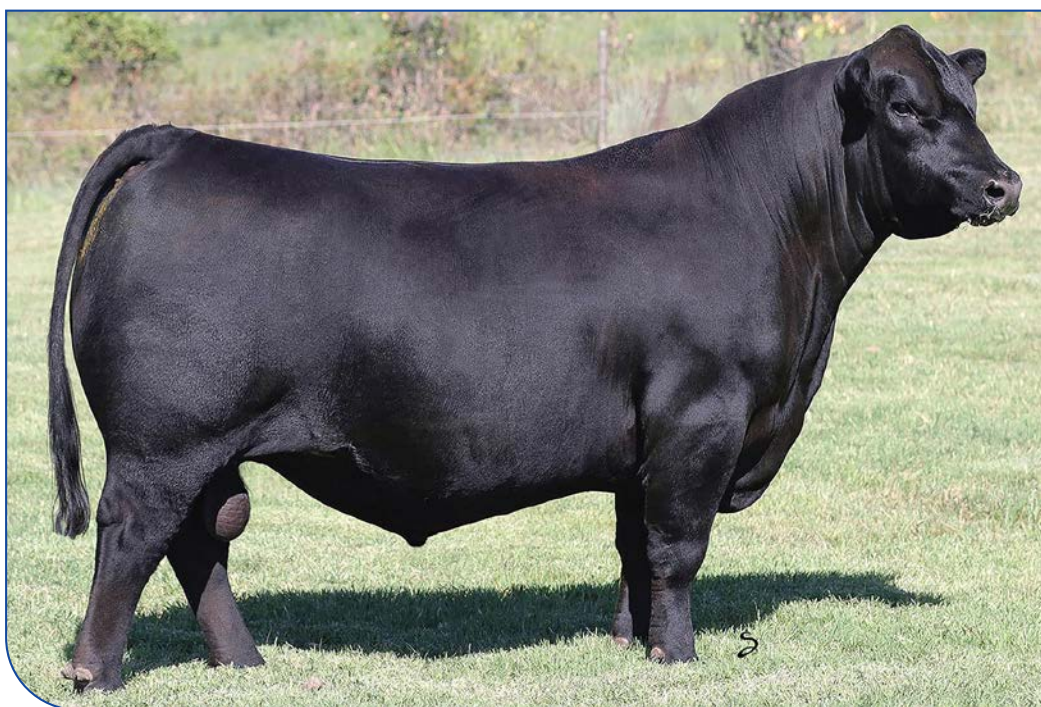
Stevenson Turning Point - Sire of Lots 29 & 30