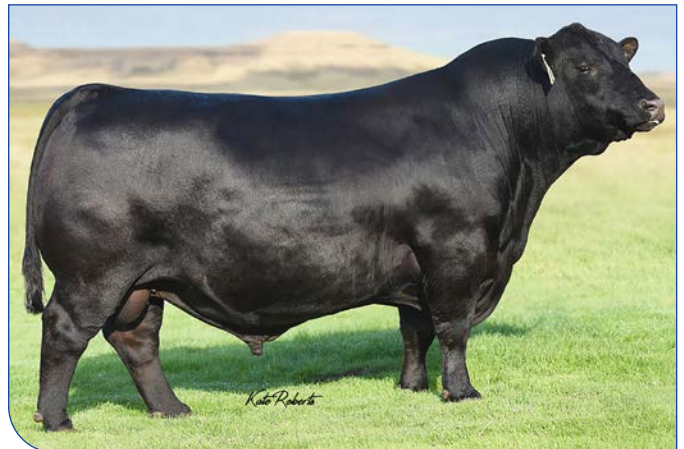
V A R Power Play 7018 - Grandsire of Lot 21