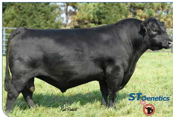
G A R Sunbeam - Sire of Lot 36

A direct son of G A R Sunbeam, tracing back to Sandpoint Blackbird 8809. He sells with a tremendous +124 on yearling weight, +10 on CED, and +312 on $C index values. Acceptable for heifers. He's a sleep-easy kind of bull that you'll want to keep every daughter that he produces in his lifetime.