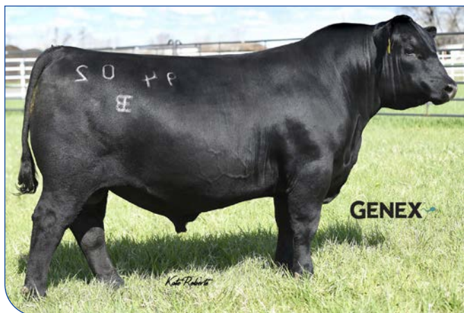
E & B Wildcat 9402 - Sire of Lot 34

This direct son of E&B Wildcat 9402 traces back to an own daughter of Stevenson Turning Point and PVF Insight 0129, making him a calving-ease specialist with a +11 on CED. Not to mention a +37 on Milk, with a +303 on $C index values. He has potential to produce show heifer prospects that will be competitive in the showing as well as maternal production females that will raise high-yielding feeder calves.