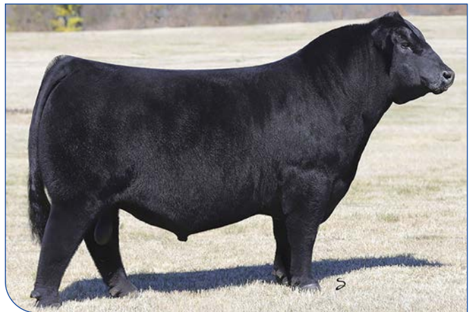
Conley Express 7211 - Sire of Lot 33 embryos

• Embryos are located at APS, please call to schedule pick-up