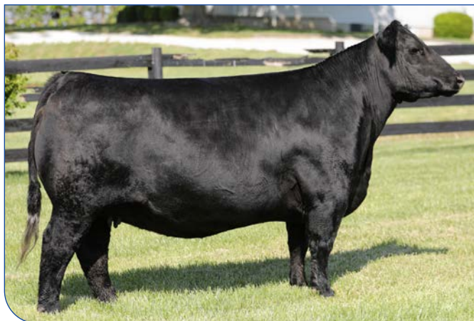
FCF Proven Queen 717 - Dam of Lot 10