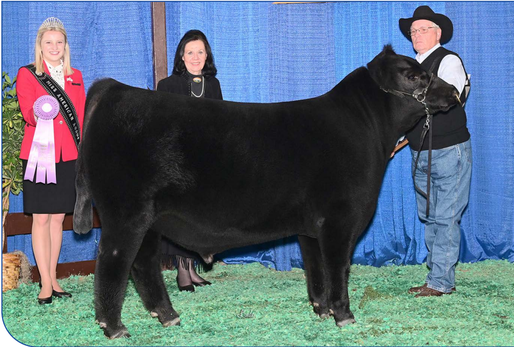
APS Walter Express 20330689 - Full sib to embryos