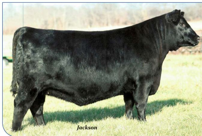
Heritage H344 Isabel 230 - Lot 23