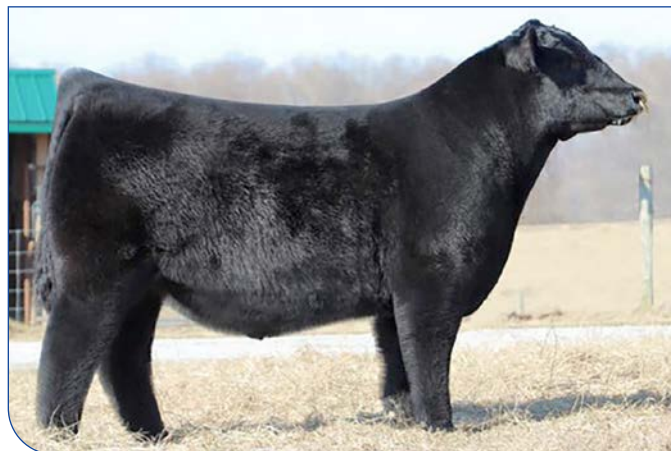
SCC SCH 24 Karat 838 - Sire of Lot 6