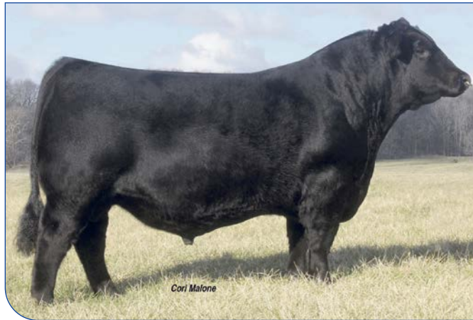
Chestnut Knock Out 204 - Sire of Lot 31