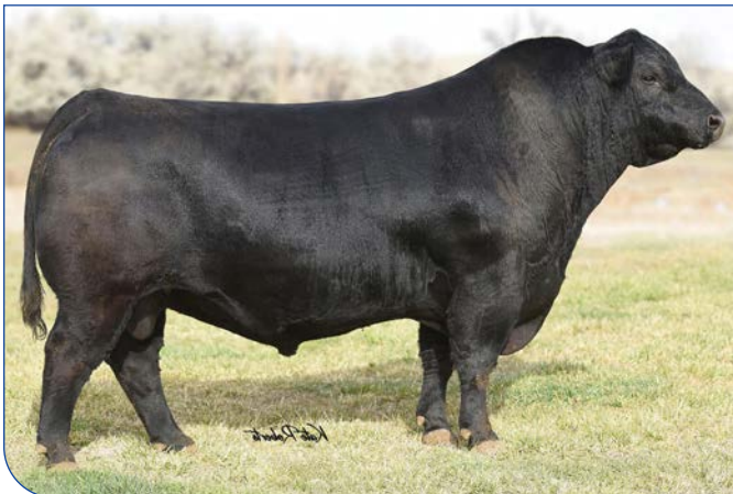
Musgrave 316 Exclusive - Grandsire of Lots 18-20