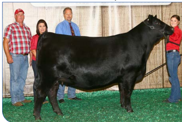
S A F Lucy Pride 9135 - Dam of Lot 13