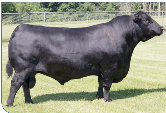
Square B True North 8052 - Sire of Lot 22

• This is a True North daughter that has the look to be the front pasture kind. Being bred to the breed's great Growth Fund, this mating has unlimited potential! Be sure to check her out sale day! Bred 12/1/2023 to Growth Fund.