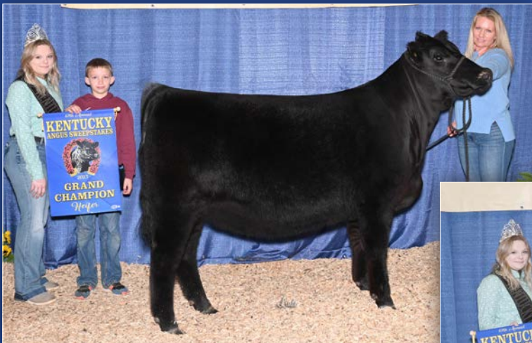
2023 CHAMPION ANGUS HEIFER