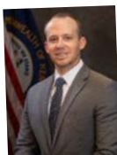
Jonathan Shell Commissioner of Agriculture Commonwealth of Kentucky