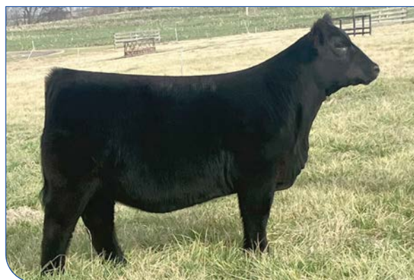
Womack Lucy 332 - Lot 12

• A unique opportunity to invest in a powerful breeding piece. Womack Lucy 332 is powerfully built from the ground up, big footed, stout boned, big hipped with a great front one third. She also has a star-studded pedigree that is made up of cattle that have produced a tremendous number of showring winners nationwide. We feel like this female can not only produce competitive show cattle in the Angus breed but also in multiple breed programs. A rare opportunity to add to your Donor program.