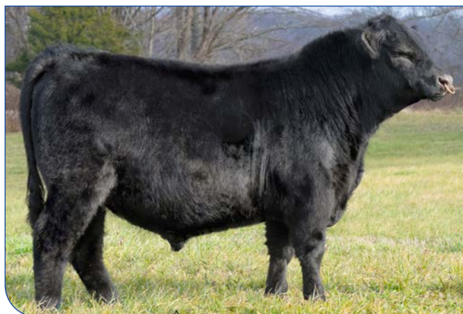
PF Wall Street 20K - Lot 37

This own son of Wall Street is sure to add pounds to your future calf crops. He is deep through his rib dimension, along with a very stout bone and skeletal structure in his overall makeup. Structural soundness is the key phrase in describing this individual. Going back to the Elverelda cow family on the bottom side of his pedigree, this young herd sire has powerful genetics all across the board. He is sure to add value to any commercial or registered cattlemen's operation. Look him over in the stalls in Louisville!