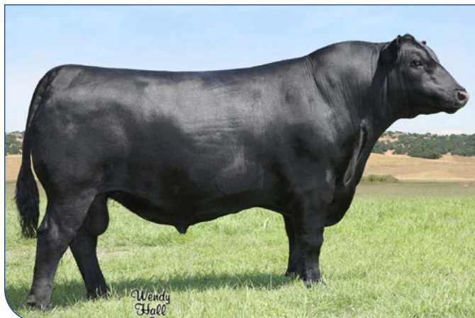
Hoover Know How - Sire of Lot 26

A beautiful September heifer sired by Summation out of a Final Product dam creating an interesting genetic pedigree. Weaning and Yearling weight EPDs in the top 10 percent with Milk and $W in the top 2 percent. Bred on 6/18/23 to Baldrige Jordan. This mating should make a powerful genotype, phenotype and EPD package. Examined safe.