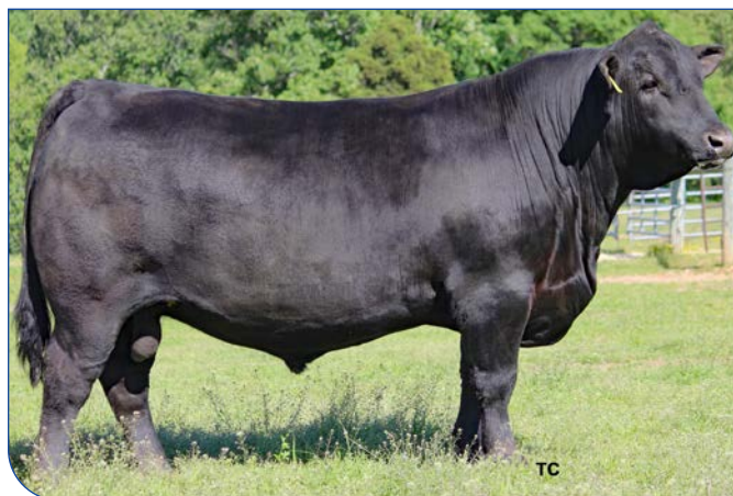
BJ Surpass - Sire of Lot 24

• The cow family on this female needs no introduction! How about an awesome BJ Surpass daughter from the Meyer's Kem family. In the 2023 Family Values sale, Millstone Farm selected the Lot 18 Kem daughter for $13,000. Everyone knows how desirable the BJ Surpass offspring have become. This young donor prospect offers superb maternal merit with a big rib and stout build. She sells due to calve 3/19/2024 to the very popular Select Sires roster member Wilks Regiment 9035. Own a building block with a world of opportunity; don't miss this exciting lot.