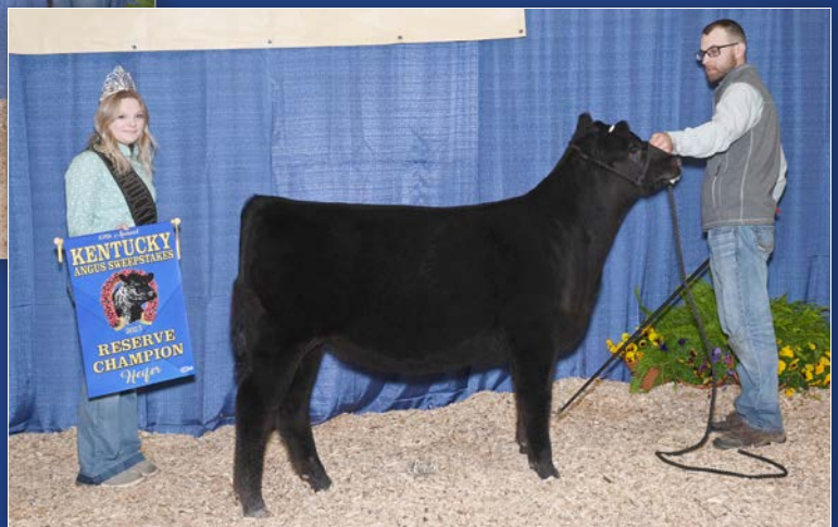
2023 RESERVE CHAMPION ANGUS HEIFER