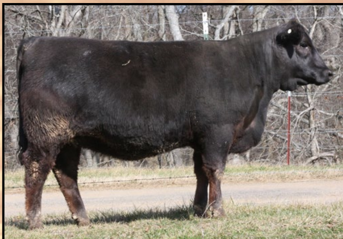
MS CCRC GODFATHER SAM 599K

MS CCRC Godfather Sam 599K is a homo black, homo polled Purebred Gelbvieh heifer that is difficult for us to let go. Her dam is one of our Dam of Merit cows that produces an excellent calf year after year. Her pedigree includes Lazy TV Sam and Black Impact who is renowned for producing excellent heifers. MS CCRC Godfather Sam 599K had a weaning ratio of 103 coming off a 70 lb birthweight. She has a well-balanced (genomically enhanced) EPD profile and a baby doll disposition. Confirmed bred, she sells AI'd to Chief Justice C205 (AMGV1325089) on 12/13/2023 and pasture exposed to Edison Lincoln 707J (AMGV1504385) from 12/31/2023 through 02/28/2024.