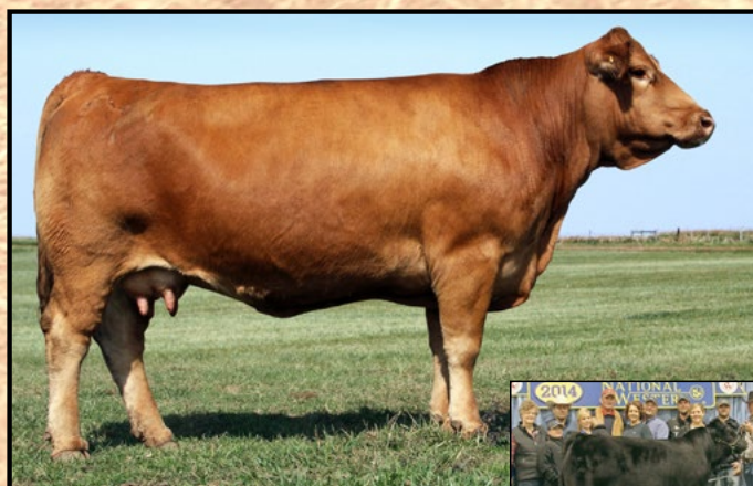
EGL P016 ET - DONOR DAM OF LOTS 20, 21, AND 22

EGL P016 was the homozygous polled, diluter free, anchor donor for the Gelbvieh Bar None Ranch program. She produces top quality no matter what sire she is mated to. Her progeny have that extraordinary performance and style that set themselves apart. She has grossed well over $250,000 with numerous individuals selling for $10,000 plus. She is a full sister to EGL Fawn, EGL Farrah (both NWSS Grand Champion Females) and EGL Decade (breed influence AI sire). You'll want to take advantage of this opportunity to add her influence to your program. Selling 5 frozen IVF embryos sired by Alumni. Resulting progeny will be homozygous polled. Embryos will be available for pickup sale day. Shipping can be arranged at buyer's expense.