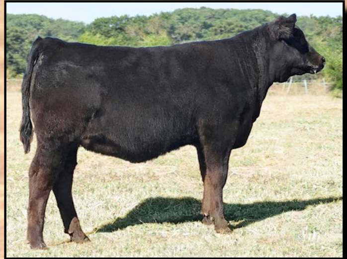
MS S & S GO TIME 354L

Ms S & S Go Time 354L is sired by the 2022 People's Choice Balancer Bull Futurity Champion Go Time 781J. She's a true breeding piece. Outstanding eye appeal, solid pedigree, and an EPD profile that is sure easy to work with. She will be one of the first Go Time progeny to be offered. Her dam is a solid producing female and a program favorite. Check this young lady out if you're wanting an impact female for your program.