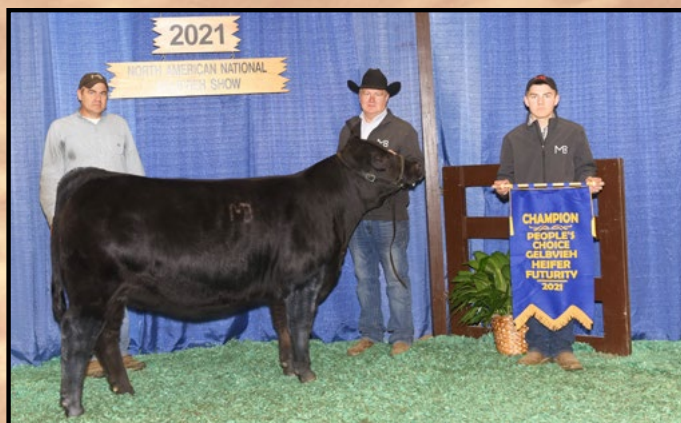
WAM JENNY 029H FULL SIB TO LOT 19 EMBRYO PACKAGE

These embryos are the same mating that produced WAM Jenny 029H, the 2021 People's Choice Gelbvieh Heifer Futurity Champion. The dam of the embryos is Jenny 11U. At 16 years old she is still producing the good ones. The sire of the embryos, ADS Godfather 575C, needs no introduction. He has made a huge impact on our breeding program and across the breed. Selling 3 embryos and guaranteeing 1 pregnancy.