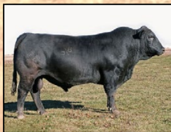
CCC MR IMPACT Z204 (10 UNITS) DONATED BY SKAGGS CREEK FARMS AMGV1203822