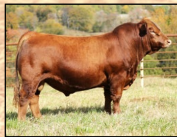
BCGF GENERAL LEE J207 (10 UNITS) DONATED BY BUTLER CREEK FARMS GELBIEH AMGV1522345