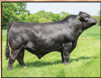
ALL AMERICAN J109 (10 UNITS) DONATED BY COLES BEND CATTLE COMPANY AMGV1537675