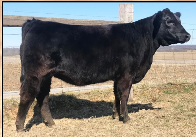
MS S & S LIFELINE 259K

Ms S & S Lifeline 259K is a homo black, homo polled bred heifer that is easy on the eye. Her dam is a program favorite for the S & S Gelbvieh tracing maternally to the great EGL P016 donor. 259K has a wonderful disposition and is backed by a tremendous cow family. She will be the keeping kind. She is bred to Big Andy D672 (AMGV1356650) on 1/30/24.