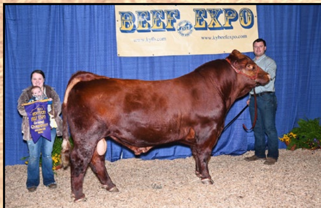
GC BULL: Fiesta's Edition EXHIBITED BY: TB Cattle Company