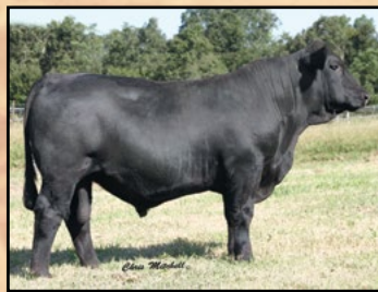
CAROLINA EXCLUSIVE 1230Y (10 UNITS) DONATED BY COLES BEND CATTLE COMPANY AMGV1220437