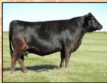
CTR HIGHLIGHT 066K (PIC: MS S & S HEIDI 990W - A HIGHLIGHT 066K DAUGHTER) (5 UNITS) - DONATED BY PLEASANT MEADOWS FARM AMGV721537