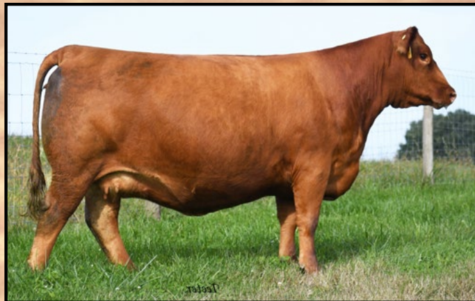
GHGF 525D - DAM OF LOT 10

Fireheart is an Arapahoe daughter out of GHGF 525D. 525D is one of our top red females. This young lady is easy on the eye. She has great outcross red genetics and will be easy to breed to any of your favorite red Gelbvieh bulls. Note her EPD profile is well balanced for growth and maternal. Fireheart sells open and ready to breed.