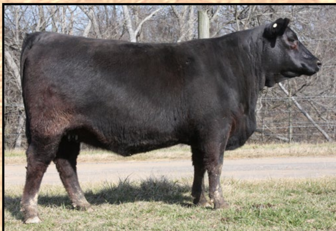
MS CCRC MAIN ST DITKA 595K

MS CCRC Main St Ditka is a homo black, homo polled easy fleshing Balancer heifer that has been a pleasure to manage over the past year or so. She has one of the best dispositions to ever come out of our operation. With very little encouragement, she would become the biggest pet on the farm. MS CCRC Main St Ditka is very easy fleshing and has a balanced EPD profile with (genetically enhanced) Growth and Maternal EPD's averaging in the top third of the breed. Confirmed bred, she sells AI'd to Lazy TV Sam U451 (AMGV1079233) on 12/13/2023 and pasture exposed to Edison Lincoln 707J (AMGV1504385) from 12/31/2023 through 02/28/2024.