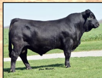
NEW HORIZON C51 ET (10 UNITS) DONATED BY SKAGGS CREEK FARMS AMGV1322615