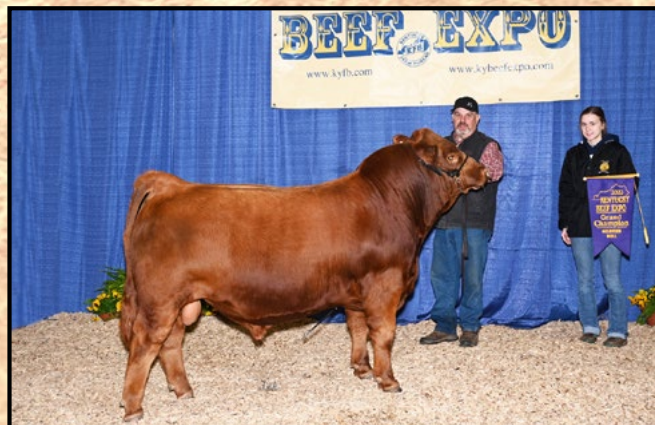
GC BULL: Fireball 1201J ET EXHIBITED BY: Locust Hill Farms