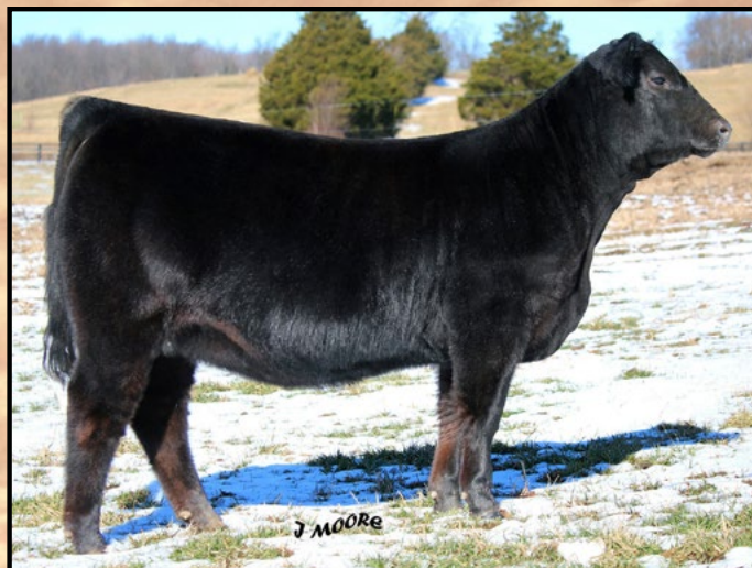
SHE'S A LADY 304L

Here is our best Show Heifer Prospect. She is a 50% Balancer and the first calf from our multi-Champion Frontrunner/ Leverage daughter KILB Jasmine 104J. She is sired by the highly demanded Angus sire: SAV Bismarck. Very simply, she is our kind of quality on paper, growth, and has that competitive design to give a wonderful look that we're after. Donor opportunity here, folks! She sells open. Make sure she gets on your trailer at the end of this sale!