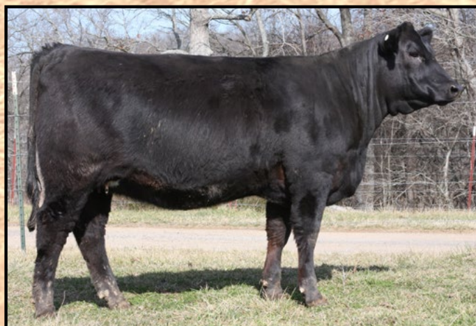
MS CCRC FRONTIER VIVIAN 621K