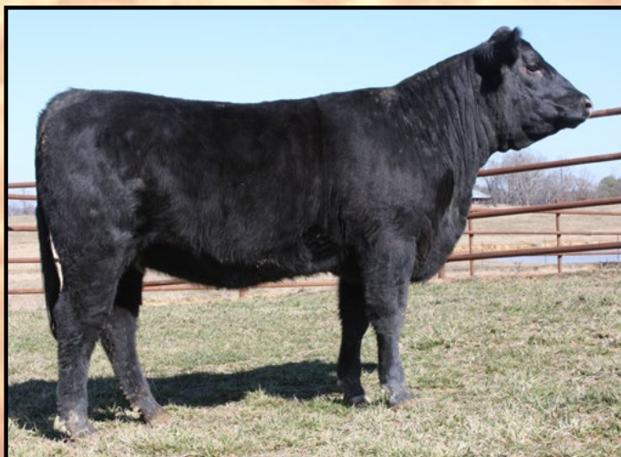
MS REBEL YELL 215K

Ms Rebel Yell 215K is another incredible heifer sired by Rebel Yell. She has a deep body with good EPDS and lots of potential. Her sire, Rebel Yell, was the 2020 NWSS Grand Champion Balancer Bull and People's Choice Balancer Bull Futurity Champion. Pasture exposed to 3G Frontier Justice 829F (AMGV1420886) from 12/1/2023 to 2/15/2024. Confirmed bred.