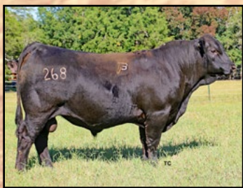
TJB VICTORIO 268K (10 UNITS) DONATED BY TJB GELBIEH AMGV1559037