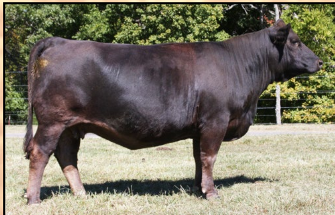
MS S & S BLUE'S IMPACT 980G FULL SIB TO LOT 21 EMBRYO PACKAGE

EGL P016 was the homozygous polled, diluter free, anchor donor for the Gelbvieh Bar None Ranch program. She produces top quality no matter what sire she is mated to. Her progeny have that extraordinary performance and style that set themselves apart. She has grossed well over $250,000 with numerous individuals selling for $10,000 plus. She is a full sister to EGL Fawn, EGL Farrah (both NWSS Grand Champion Females) and EGL Decade (breed influence AI sire). You'll want to take advantage of this opportunity to add her influence to your program. Selling 3 frozen IVF embryos sired by Blue's Impact. Resulting progeny will be homozygous polled. Embryos will be available for pickup sale day. Shipping can be arranged at buyer's expense.