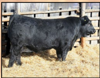
DAVIDSON JACKPOT 74Z (10 UNITS) DONATED BY SKAGGS CREEK FARMS AMGV1248679

Bring your tank on sale day and save on shipping!!