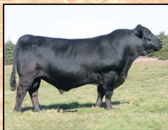
HYEK BLACK IMPACT 3960N (10 UNITS) DONATED BY SKAGGS CREEK FARMS AMGV844875