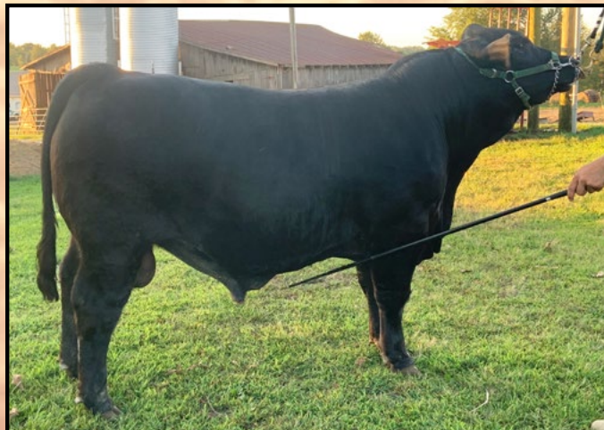
LIL ED - SIRE OF LOT 9

Lady Antebellum is a sweet disposition daughter of Lil Ed and one of our top spring heifers. Her dam has done a fantastic job for our program. Her grand dam is a full sister to Ms Astro 807A, the donor dam of Lot 16 embryo package. Be sure to study her EPD profile. It'll be easy to work with when making breeding choices. Lady Antebellum sells open and ready to breed.