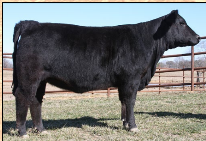
MS REBEL 304L

Ms Rebel 304L is a Rebel Yell daughter that has a world of potential in her future. She has a quite disposition and would be a great show heifer prospect. She is one of our best females from the 2023 spring calf crop. Study this one closely if you need a competitive heifer that will be a highly productive brood cow for years to come.