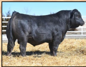
CTR JACKPOT 8660F (10 UNITS) DONATED BY COLES BEND CATTLE COMPANY AMGV1468377