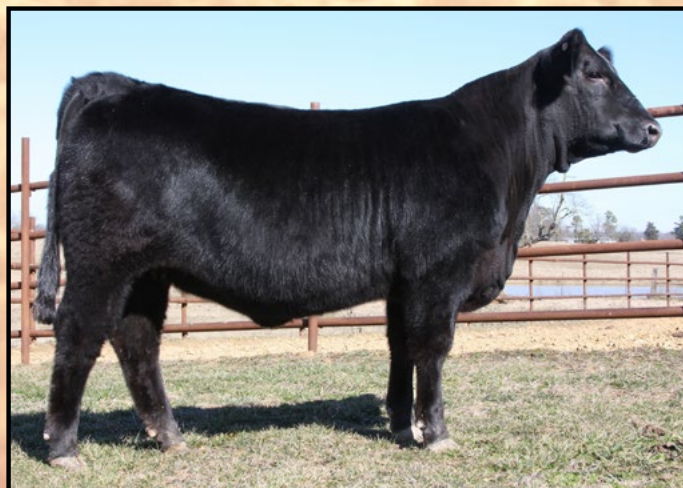
MS REBEL 222K

Ms Rebel 222K is a Rebel Yell daughter that has been shown successfully. She won her class and division in the 2023 Ky State Fair open and junior show. At the 2023 NAILE, she won her class in the open show and was reserve division in the junior show. 222K had a modest 75 pound birth weight and has had a great growth pattern since. She is easy on the eye and is backed by a tremendous cow family. She will be a front pasture female that you can count on. Aled to 3G Frontier Justice 829F (AMGV1420886) on 10/20/2023. Confirmed bred.