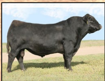
TAU INFINITY 47C (10 UNITS) DONATED BY SKAGGS CREEK FARMS AMGV1319015