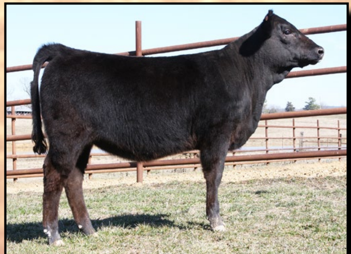
MS O GRAND ENTRY 397L

Ms Grace 397L is a purebred Gelbvieh heifer with a great deal of potential. 397L's sire is 3G Grand Entry 933G. We purchased Grand Entry in Denver in 2020. He has been an outstanding herd sire for our program adding eye appeal, size, and performance. Grace has strong EPDS for growth. She is a sweetheart with lot of show potential going forward. She would make a great addition to any herd.