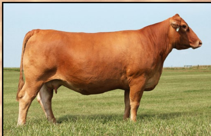
MS ASTRO 807A ET FULL SIB TO LOT 22 EMBRYO PACKAGE

EGL P016 was the homozygous polled, diluter free, anchor donor for the Gelbvieh Bar None Ranch program. She produces top quality no matter what sire she is mated to. Her progeny have that extraordinary performance and style that set themselves apart. She has grossed well over $250,000 with numerous individuals selling for $10,000 plus. She is a full sister to EGL Fawn, EGL Farrah (both NWSS Grand Champion Females) and EGL Decade (breed influence AI sire). You'll want to take advantage of this opportunity to add her influence to your program. Selling 2 frozen IVF embryos sired by Astro. Resulting progeny will be homozygous polled. Embryos will be available for pickup sale day. Shipping can be arranged at buyer's expense.