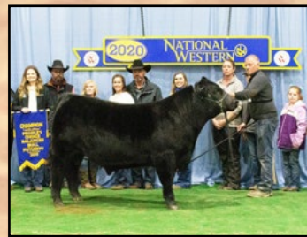
TJB REBEL YELL 804F (10 UNITS) DONATED BY TJB GELBIEH AMGV1448912