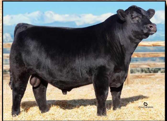
FRONTRUNNER - SIRE OF LOT 2

Ms S & S Frontrunner 351L is a homo black, homo polled heifer from the top of our 2023 calf crop. Sweet disposition, solid producing dam, and great personal performance in this young female. Her "No Holes" EPD profile is in the top 50% for 11 of the first 12 traits. You'll definitely want her for your breeding program.