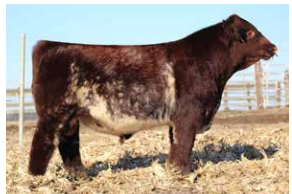
Leveldale Rolling Stone 907G

Here is an opportunity to buy semen on our young herd sire. Rolling Stone was the lead bull in the 2020 National Western Stock Show Reserve Grand Champion Pen of 5 Bulls for Leveldale. His half brother is Leveldale Boardwalk that is doing great things for Cates Farms. Buy with confidence and help the Kentucky Junior Shorthorn Association youth!