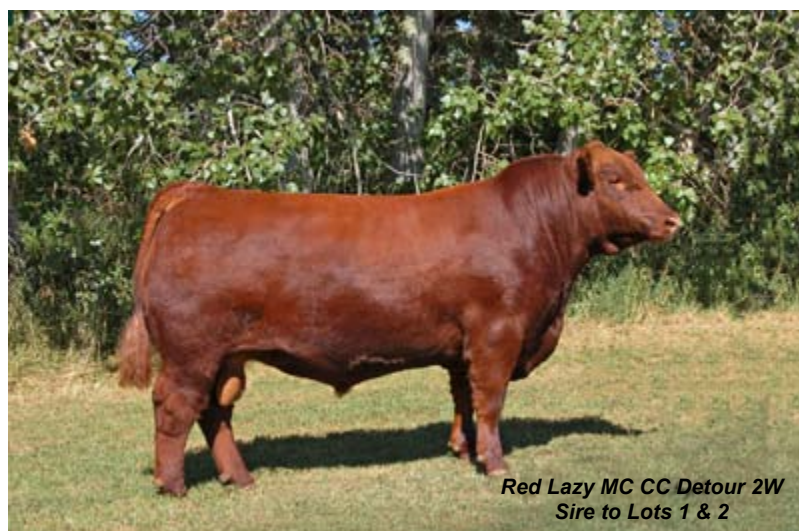
Red Lazy MC CC Detour 2W Sire to Lots 1 & 2

This heifer here is out of one of our oldest line of cows. Sired by one of our favorite bulls. Right now we have quite a few Detour daughters on the ground and would like to share this one with you. This girl is sure to make a great brood cow after her career is over.