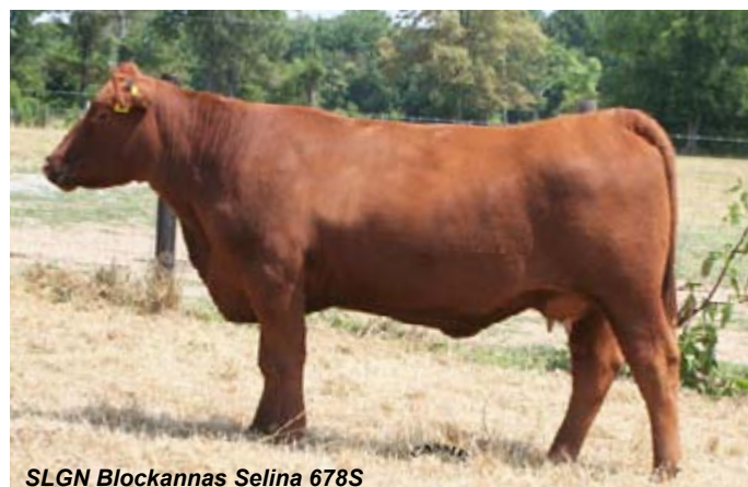
SLGN Blockannas Selina 678S

PERKS ADVANCE 121R SLGN BLOCKANNAS SELINA 678S (1112470) FEDDES BLOCKANNA 807