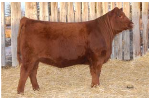
Maternal Grand Dam Red Lazy MC Gold 33Y

This cow has a fantastic set of EPD's and the genetics behind her. She is very level across the top, deep bodied, and has the length to her. Her maternal characteristics and dark red color make for a very attractive appearance. She is structurally built and would be a great addition to anyone's heard.