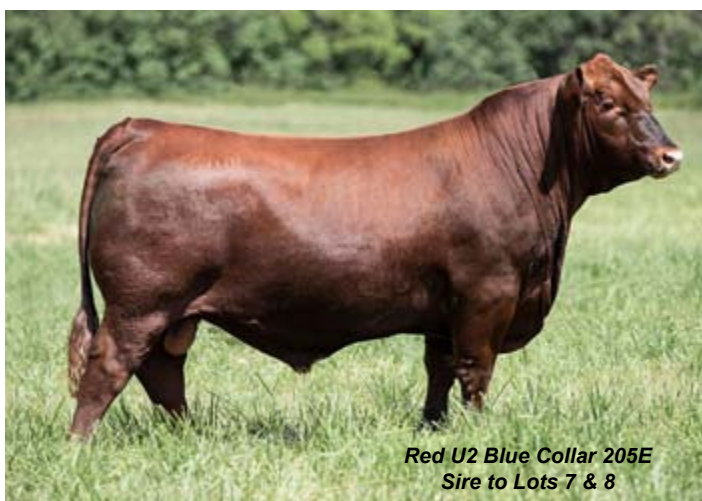
Red U2 Blue Collar 205E Sire to Lots 7 & 8

This June Heifer has loads of volume and we think she has a great future in and out of the show ring. Her Sire is WCS 5L Lance 809 and she is out of the WCS Miss Dynasty 8020 cow who continues to make great cows.