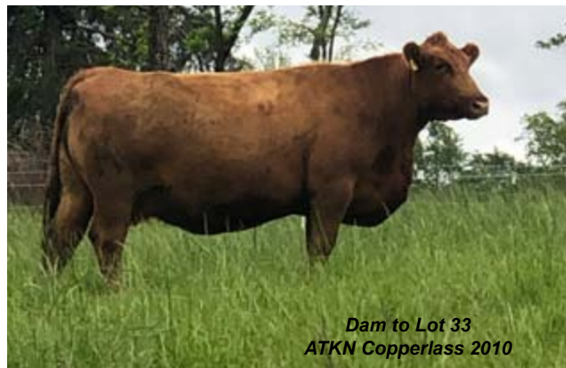
Dam to Lot 33 ATKN Copperlass 2010