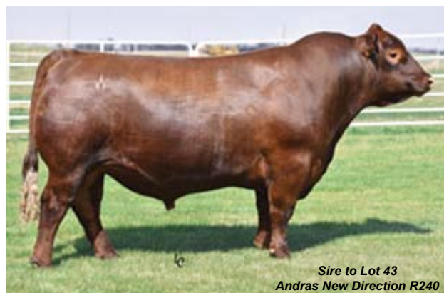
Sire to Lot 43 Andras New Direction R240

A pedigree that needs very little introduction stacking New Direction on Gold Robber. Her dam is still going strong at 11 years. 119F is deep sided, square hipped with a nice udder. New Direction daughters are known for their productivity and Gold Robbers have more than proven themselves as productive females. Her heifer calf at side, sired by a son of Cowboy Cut is stylish and cowy made. Zaxby has been 'retired' for several years, this will likely be his last calf.