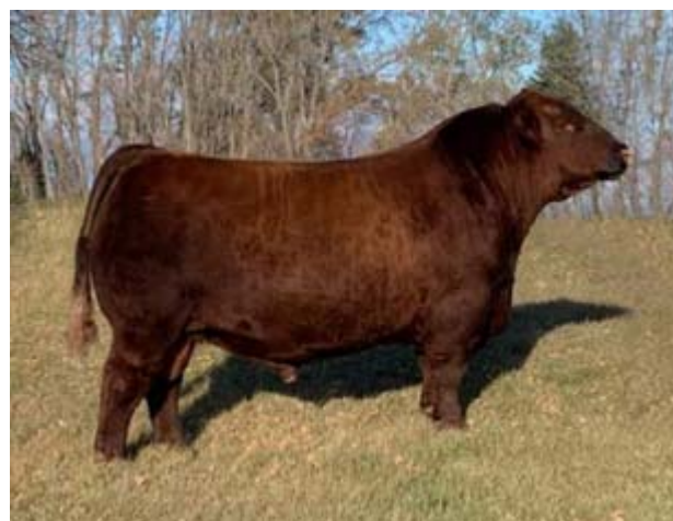
KJHT Power Take Off Sire to Lot 14

This daughter of the National Champion bull PTO is sure to please the lucky new owner no matter what you have planned for her. She has the look to be a competitive show heifer at all levels and she comes from one of top producing donors which guarantees her to become a great cow. Latch on to this one and buy with confidence!