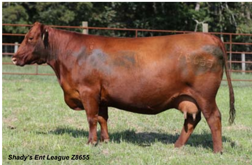
Shady's Ent League Z8655