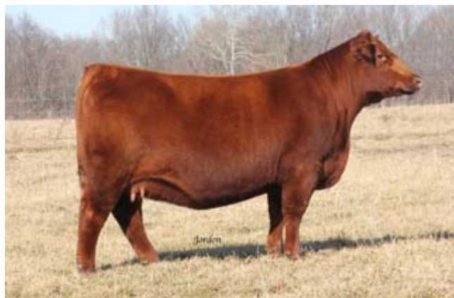
J6 Ms Holly D603 Dam to Lot 15