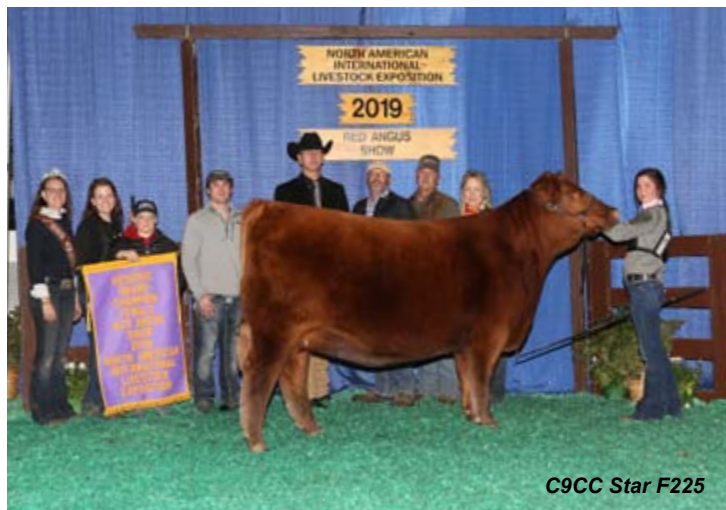
C9CC Star F225

This set of embryos could be called the 'Big E Special', the females sired by Next have been phenomenal and the influence of Mimi W085 is has worked wonders on the Star cow family. C9CC Star F225 had an impressive career on the tan-bark, and is without question, one of the most impressive females we have raised to date. Embryos on this females should never be offered for sale, but here's your chance!