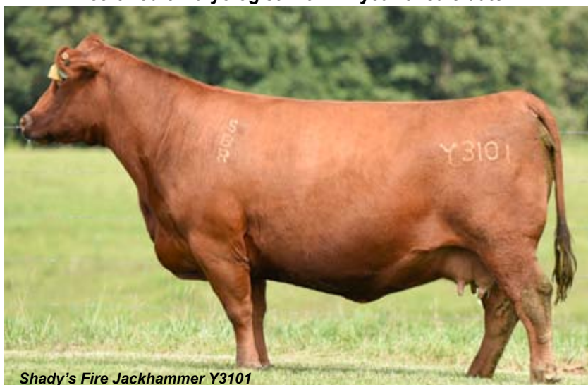
Shady's Fire Jackhammer Y3101

Guarantee of 1 90 day pregnancy if implanted by a certified embryologist within 1 year of sale date.