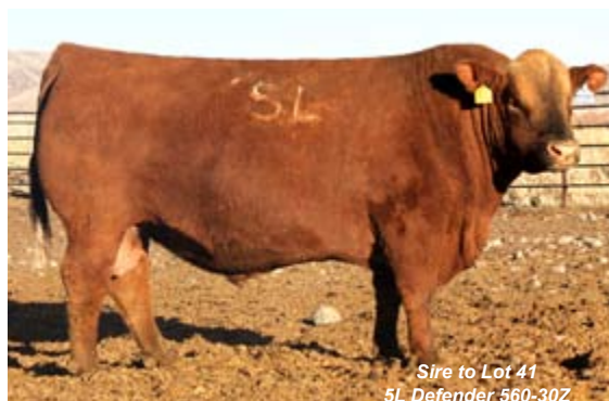
Sire to Lot 41 5L Defender 560-30Z

If you are looking for a powerful, productive female, then this is the one. Maternally, this cow is one you will be thankful for when she is raising a calf. This 10-17-2020 heifer calf at side can be halter broke if you are looking to show or will make a great heifer for your cow herd. These two make a perfect, powerful pair. Cow has been pasture exposed to Diamond P Fletch F804 # 4017524 since 1-11-2021