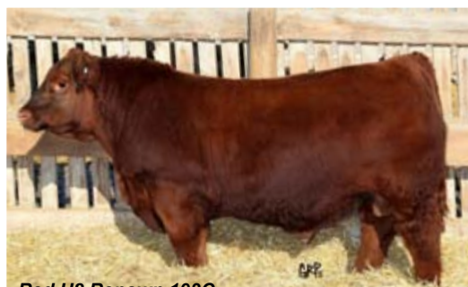
Red U2 Renown 193C

I made this set of embryos this past spring and put several of them in fresh. Renown has quickly become a household name amongst the Red Angus breed and the quality found in his progeny is sure to compliment all that B023 has to offer. I have a lot of faith in this mating, the maternal power in this pedigree is sure to render success down the road!