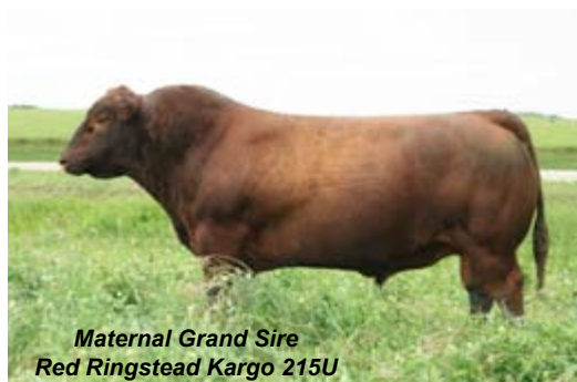
Maternal Grand Sire Red Ringstead Kargo 215U

We're beyond excited to be offering semen on the Triple-Crown Champion, TWG Red Eye Special 301F. Without a doubt, one of the highest quality, soundest structured, most dimensional red angus bulls to walk. Sires this elite are few and far between, but offering this flush-quality semen is a true rarity! Red Eye Special has already seen heavy-use in Emerald, and we can't wait to see his impact across the breed!