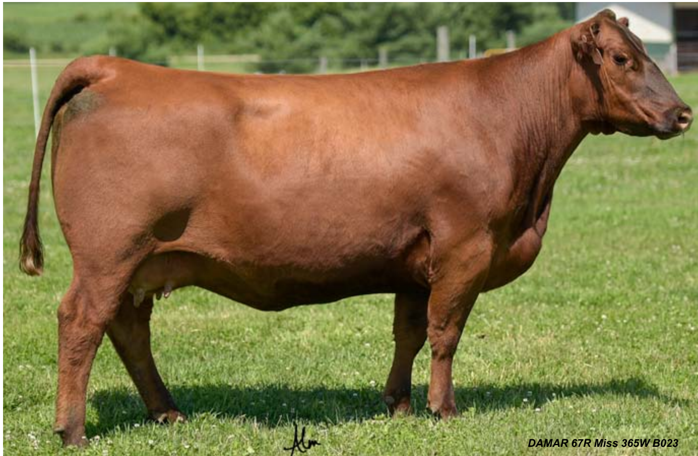
DAMAR 67R Miss 365W B023