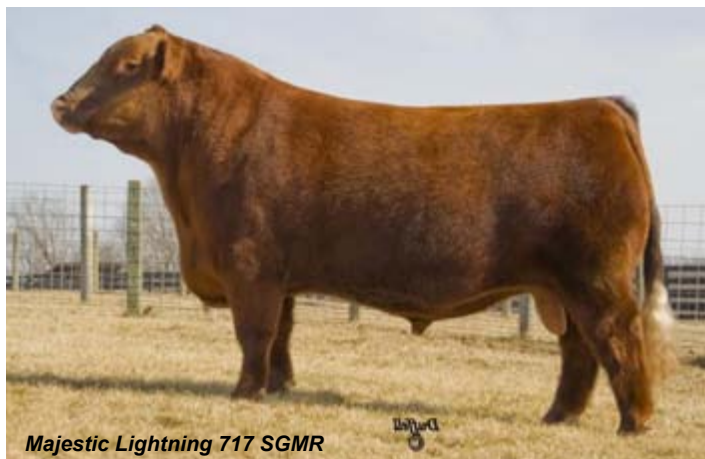
Majestic Lightning 717 SGMR