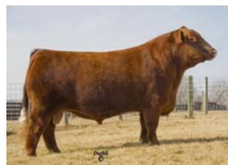
Majestic Lightning 717 SGMR Maternal Grand Sire to Lot 13