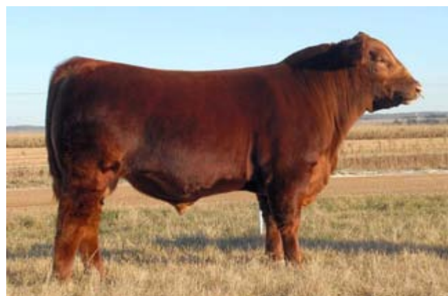
NBar Hamley S913 Sire to Lot 16

AI Bred to Red DKF Racer 8E on 8/3/2020. Confirmed 10/5/2020. Due 5/12/21