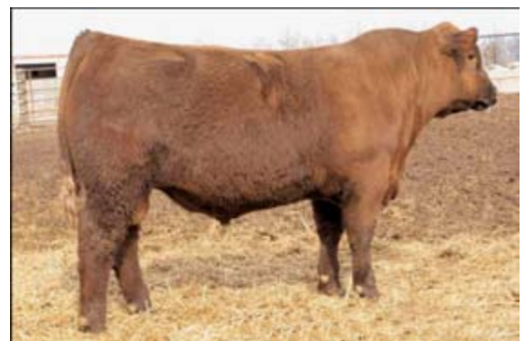
PIE Get R Done 684 Maternal Grand Sire to Lot 9

PIE GET R DONE 684 TKP BANDI 9007 (1347719) LOG PUREWATER TORI 51L