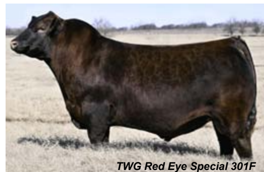
TWG Red Eye Special 301F

Damar Miss B023 and her entire lineage have produced a lot of great cattle over the years. Her natural calf from this past spring, sired by Damar Mimi E381, was one of our high sellers this fall and has already been successfully shown. We feel TWG Red Eye Special 301F is one of the best Red Angus bulls we have seen and are excited to see his influence here