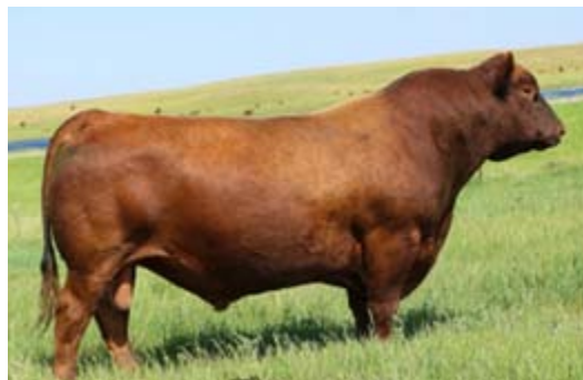
Sire to Lot 27 Bieber Spartacus A193