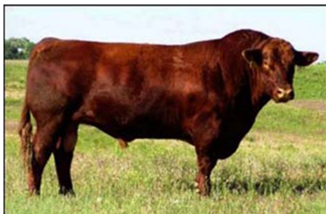
Perks Advancer 9088 Maternal Grand Sire to Lot 17