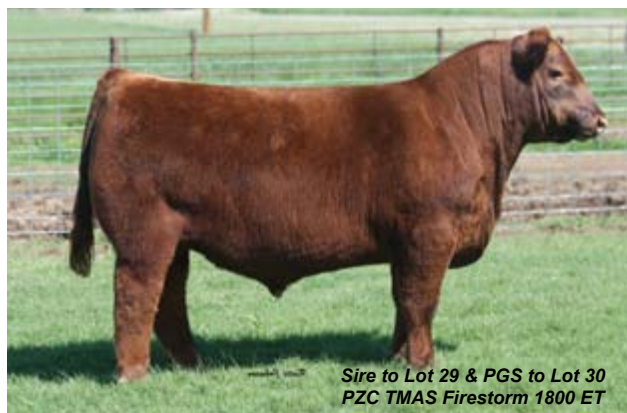
Sire to Lot 29 & PGS to Lot 30 PZC TMAS Firestorm 1800 ET