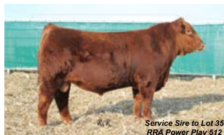
Service Sire to Lot 35 RRA Power Play 512

AI'd on 12/4 to RRA Power Play 512 (1743254) PE to SFCC Gambino 907G (4123856) from 12/14 to 1/21