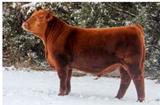
Sire to Lot 28 AHL Flashback 446B