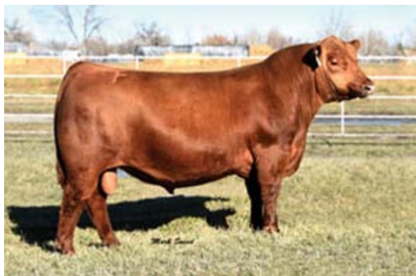
H2R Profitbuilder B403 Paternal Grand Sire to Lot 9 & 10