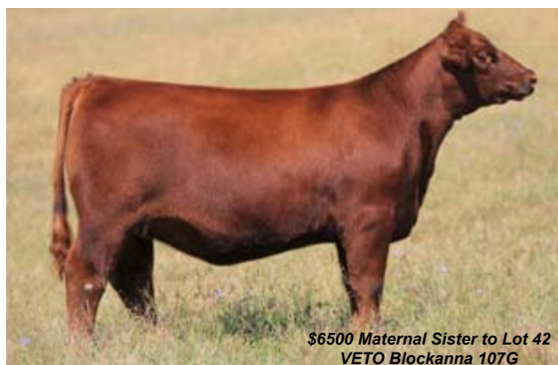
$6500 Maternal Sister to Lot 42 VETO Blockanna 107G

PE Diamond P Fletch F804 # 4017524 since 1-11-2021