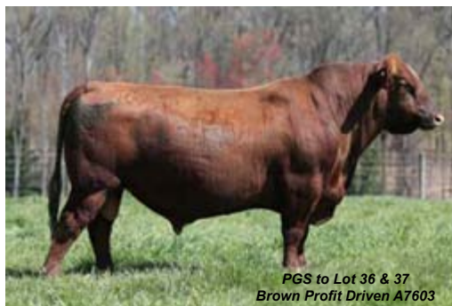
PGS to Lot 36 & 37 Brown Profit Driven A7603

This September yearling heifer is ready to go to work. You will appreciate this heifer's depth of side and fleshing ability. She has been pasture exposed to DPC G956 Reg # 4278751 since 01-11-2021.