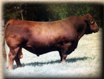
BCFG CHEROKEE 512A (10 UNITS) DONATED BY BUTLER CREEK FARM GELBIEH AMGV1257584