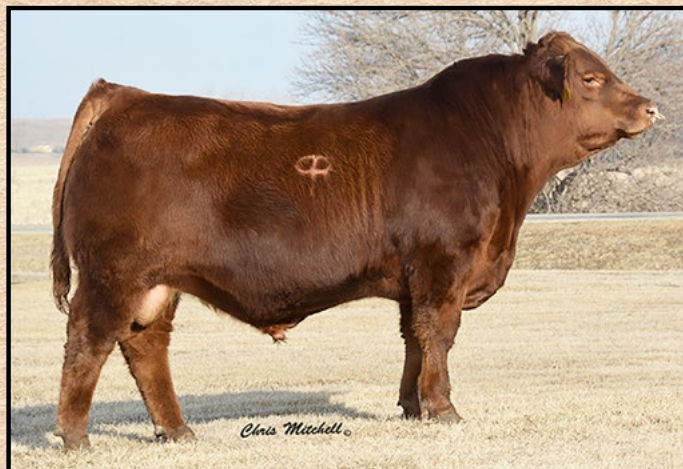
POST ROCK POWER BUILT - SIRE OF LOT 3

Mr PowerBuilt 4G is a broad, thick made son of Post Rock Power Built 37B8. He has the potential to add performance to your herd. Don't miss the opportunity to add these genetics to your herd.