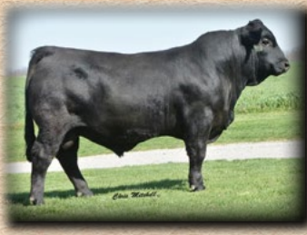
NEW HORIZON (10 UNITS) DONATED BY COLES BEND CATTLE COMPANY AMGV1322615