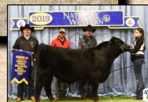
3G FRONTIER JUSTICE SIRE OF LOT 12