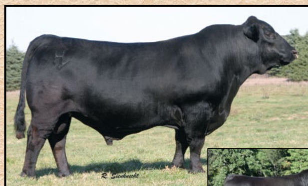
BLACK IMPACT SIRE OF LOT 11

Ms Impact 054H is the homozygous black, homozygous polled natural calf of Carolina 3326A, our lead donor. This young lady has the pedigree, eye appeal and EPD profile to increase your bottom line for years to come. Her sire, Black Impact, is well known across the breed for producing top progeny. Sells open and ready to breed this summer. Serious breeders will want to consider adding Ms Impact to their program.