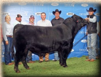
FIRST STEP 7549E (10 UNITS) DONATED BY DOBSON RANCH AMGV1393485