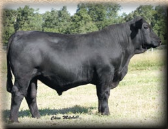
CAROLINA EXCLUSIVE 1230Y (10 UNITS) DONATED BY KILBOURNE GELBIEH AMGV1220437