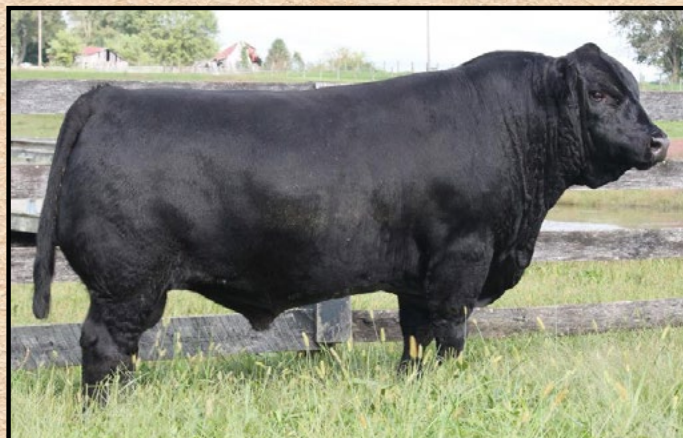
GODFATHER - SIRE OF LOTS 8, 10, 18, AND 21