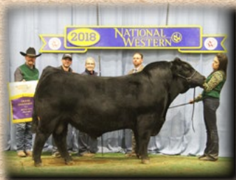
3G DIE CAST (5 UNITS) DONATED BY 3G AND REYNOLDS BEE LICK GELBIEH AMGV1354383