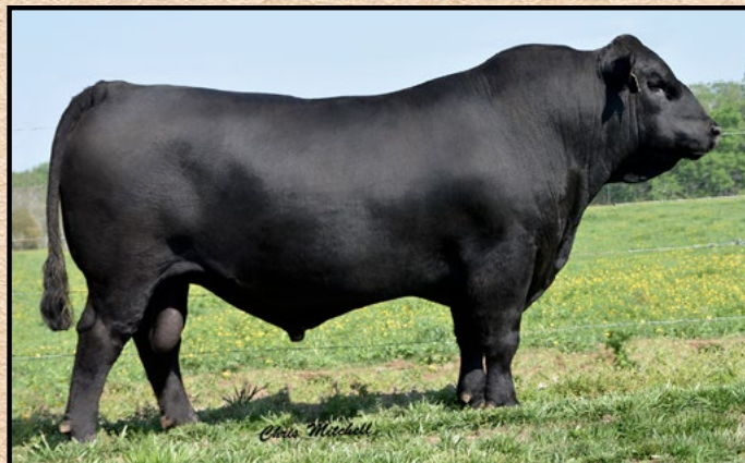
DITKA - SIRE OF LOT 16

Ms Ditka 3H is one of our top females from the spring 2020 calf crop. Her 78 pound birth weight and 688 pound adjusted weaning weight are sure easy to work with. Her EPD profile is powerful and easy to match with any bull you prefer to mate her to this spring. You'll appreciate her power, sound structure, eye appeal and quite disposition. Sells open and ready to breed.