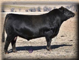
GHGF COW TOWN D536 (10 UNITS) DONATED BY GREEN HILLS GELBIEH FARM AMGV1353569