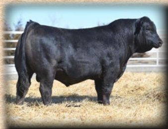
CTR JACKPOT 8660F (10 UNITS) DONATED BY COLES BEND CATTLE COMPANY AMGV1468377