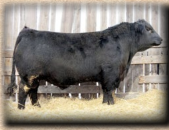
SLC VELOCITY 14C (10 UNITS) DONATED BY COLES BEND CATTLE COMPANY CDGV157517