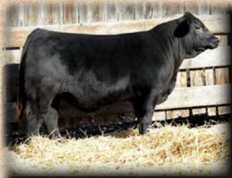
SLC VIPER 7E (10 UNITS) DONATED BY LITTLE WINDY HILL FARMS CDGV163744