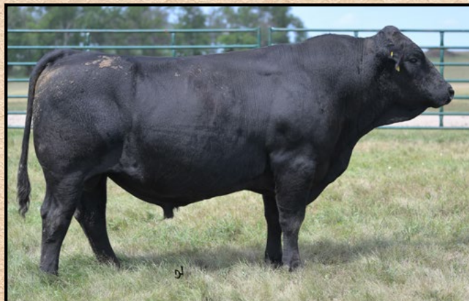
BIG ANDY D672

Big Andy D672 is an exciting Gelbvieh herd sire that combines calving ease, performance, maternal and carcass traits in an outcross pedigree. He is exceptionally sound with a big foot and ideal phenotype. His first calf crop produced some of the top selling individuals in the Eagle Pass Ranch dispersal. His daughters were viewed as some of the best in the dispersal. Upon acquiring Big Andy we sent him straight to collection. We made the decision to only sell 10 packages of 30 straws for the next two years on this breed improver. March 6 is when the last package will be offered for purchase. You'll definitely want to add these genetics to your herd! Selling 30 units of semen on Big Andy that will be available to pick up sale day.