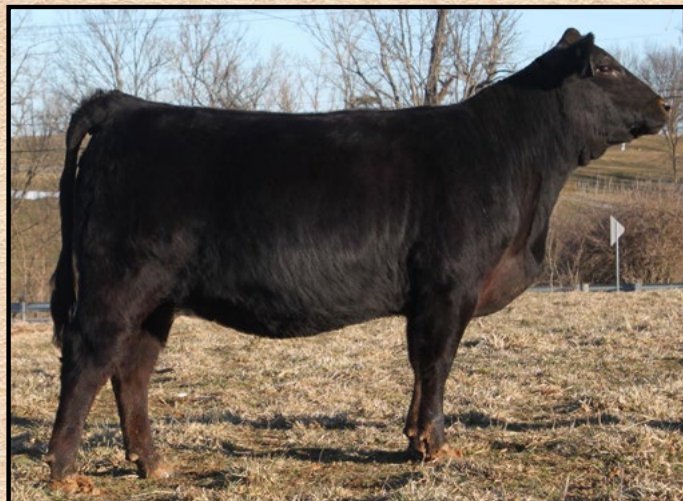
WAM AVA GRACE