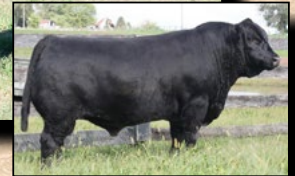
GODFATHER SIRE OF LOT 21 EMBRYOS