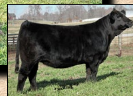
JENJ 605D DAM OF LIL ED