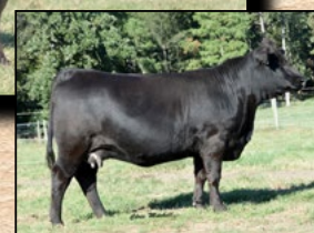
CAROLINA 3326A DAM OF LOT 11