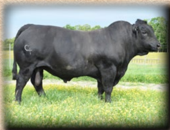
CAROLINA BIG BOUNTY 6015D (10 UNITS) DONATED BY C CROSS CATTLE COMPANY AMGV1353411