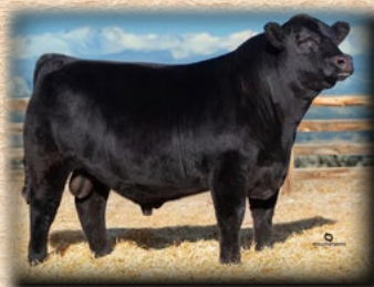
TPG FRONTRUNNER 2510F (10 UNITS) DONATED BY C CROSS CATTLE CO. AND KILBOURNE GELBIEH AMGV1439628