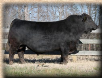
BLUE'S IMPACT 001X (5 UNITS) DONATED BY GREEN HILLS GELBIEH AMGV1177161