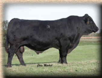
GRANITE 200P2 (10 UNITS) DONATED BY LITTLE WINDY HILL FARMS AMGV930426