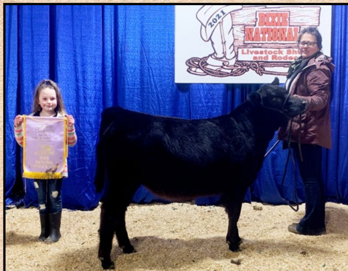
PCFS BARDOT'S DREAM

Bardot's Dream is ready to start her highly competitive show ring career, with her stacked pedigree of PVF Insight and EGL Lifeline. She is fancy, feminine, and deep bodied, yet stout footed and thick in all the right places. She has a sweet disposition. She is going to please you in the ring and do the work for you in your front pasture. We hate to see her go but we know she will add loads of quality to your string and your herd.