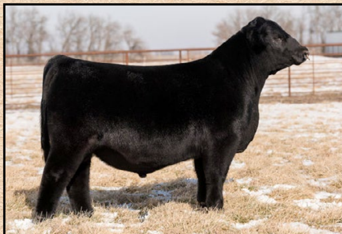
PVF BLACKLIST - SIRE OF LOT 2

We are pretty fond of this bull here at PCF, he is stout and thick throughout yet moves with ease. Being above the breed average in his weaning weight and yearling weight, we believe that 2G is going to put the pounds and bone you need in your herd but can also add the eye appeal we all love. He is docile and easily worked with. This is one you are going to want to bring home.