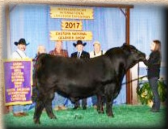
3G FORT APACHE (5 UNITS) DONATED BY 3G AND REYNOLDS BEE LICK GELBIEH AMGV1421976