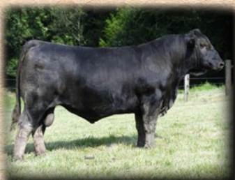
GHGF CRACKER JACK G310 (10 UNITS) DONATED BY GREEN HILLS GELBIEH AND RUPP RANCH AMGV1470983