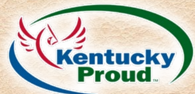
Ryan F. Quarles Commissioner of Agriculture Commonwealth of Kentucky