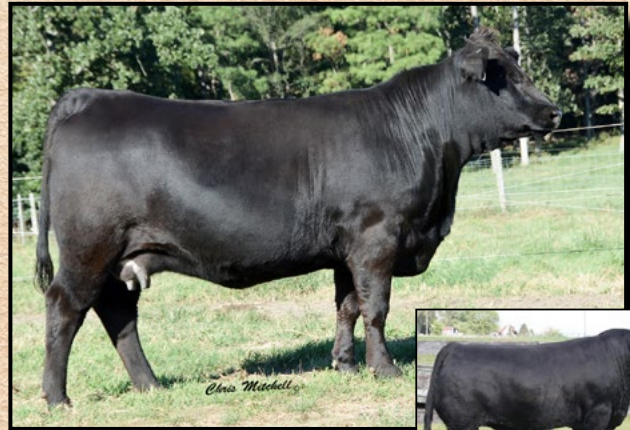
CAROLINA 3326A DONOR DAM OF LOT 21 EMBRYOS

When we purchased Carolina 3326A ET during the 2019 National Sale in Denver we were excited to add her as a cornerstone breeding piece for our programs. Carolina 3326A is a homozygous black, homozygous polled, full sister to Carolina Exclusive 1230Y. Her performance, eye appeal and EPD profile allow numerous mating options. Her flush to Godfather was at the top of our list of "to dos" and we are anxious to see the resulting offspring from this tremendous mating. We are offering 4 frozen Grade 1 embryos sired by Godfather with a guarantee of 2 pregnancies if implanted by an agreed to embryologist. An additional frozen embryo will be supplied for each pregnancy less than two. Up to two additional embryos total may be supplied to fulfill the guarantee.