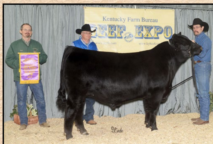
BANDOLEER - SIRE OF LOT 5

Mr Bandoleer 3G is a thick, structurally correct bull that is easy to watch when he moves across the pasture. He has great length of body and muscle expression. His dam is one of our best females in the herd. Mr Bandoleer is one you'll want to be sure to look at as he will add pounds and eye appeal to his calves.