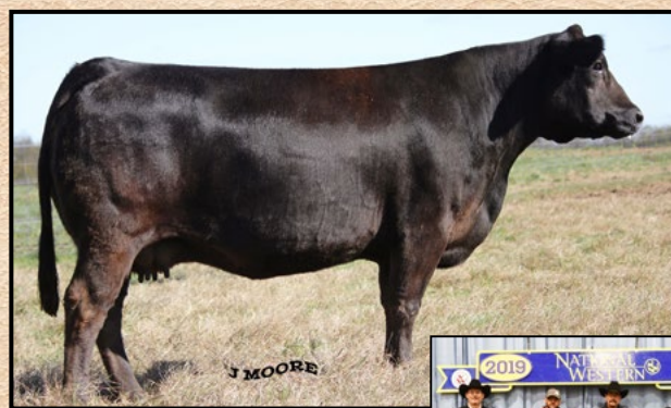
MS MAVERICK 126Y DAM OF LOT 12

Ms Frontier Justice 063H is a homozygous black, homozygous polled Frontier Justice daughter out of Ms Maverick 126Y. Ms Maverick 126Y was a sale feature and our top pick from the 2018 Spring SoKY Select Sale. She has served as donor for several programs and has always produced some of our best calves. 063H's sire, 3G Frontier Justice, was purchased in Denver after being named 2019 Reserve Grand Champion Bull and the People's Choice Balancer Bull Futurity Runner Up. He has proven to be heifer acceptable without sacrificing performance. This is his first daughter we have offered, and we feel she is one of his best he has produced to date. She will be a great show heifer prospect and a great addition for genetic improvement. Sells open and ready to breed.