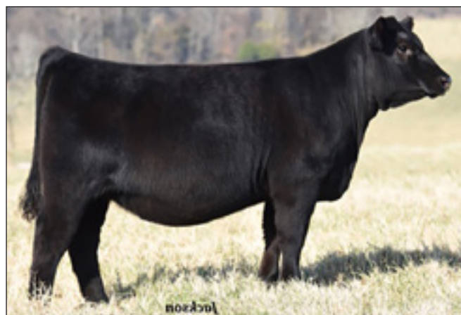
Burks 7325 Proven Queen 131G - Lot 24

131G is from the Proven Queen cow family and sired by the $450,000 Coleman Bravo 6313 who is setting the new standard for maternal excellence. She is sure to impress you with her volume, capacity and tremendous spring of rib. We think this one has a bright future. • BW 90 lbs., Adj WW 633 lbs., OCV • Sells OPEN • View her video on the For Sale page at burkscattle.com