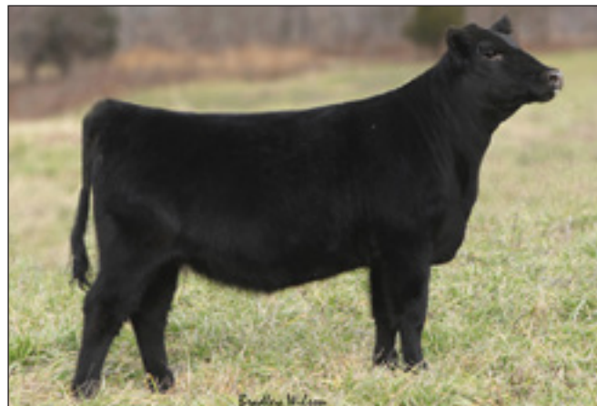
PF Blackcap 02G - Lot 20

• A May show prospect from the Skymere family, a family known for producing winning show heifers that went on to be productive producers after their show careers. Turning Point is one of the breed's most popular sons of Weigh Up and on top of his progeny's highly desirable phenotype, he records a top 1% CED of 17.