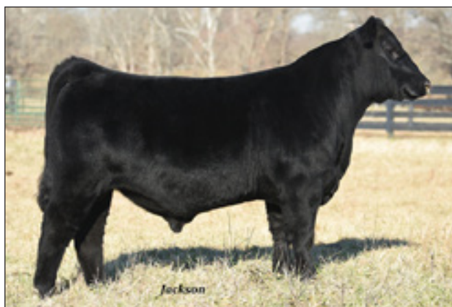
Rock Ridge Frontier G18 - Lot 45