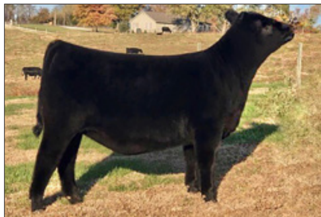
Johnson Missie 909 - Lot 19

• An outstanding April from our first-class donor that is a maternal sister to Insight. This female truly offers as much versatility as any in the offering. Extremely powerful at the ground, big ended, and robust through her center body, while still maintaining enough presence and neatness through her front end to make a very competitive show heifer. Past that, one look at this pedigree should ensure that great things are in the cards when this one hits production. Maternal legends, and breed leading, dollar generating females abound here! Great attitude on this one, as she would make a great heifer for any aged showman.