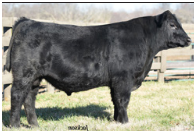
Heritage Southern Charm 908 - Lot 44