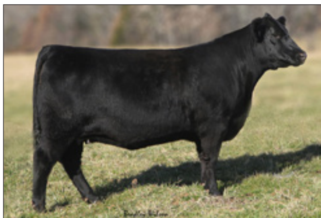
S A F Barbara 8055 - Lot 39