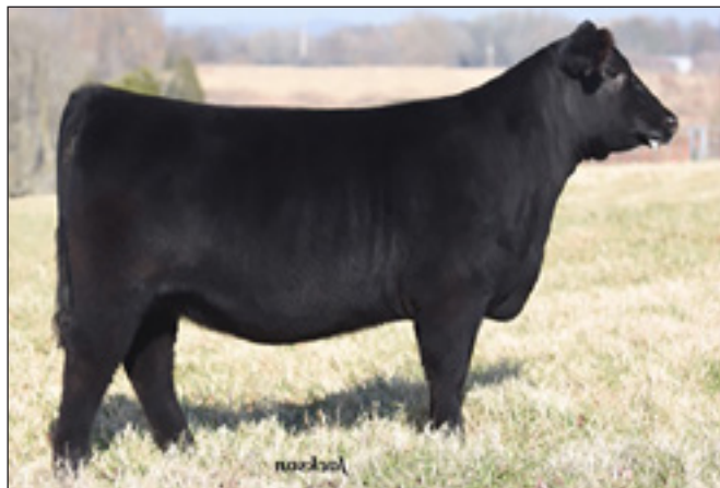
Burks 726C Princess 989F - Lot 29