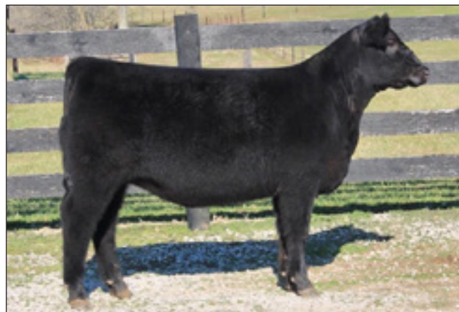
R&K Georgina 509 - Lot 16

• A real neatly designed heifer here. I've always thought this one had all the pieces to make an incredibly nice show heifer as a yearling. Fresh, attractive, and really starting to come into her own, I believe this one will continue to get better. • Backed by a 9-year-old Bismarck donor dam, this one should make an excellent female in production once you get done winning with her this summer! The 7730 cow has produced a couple really nice heifers, and consistently produces many of the most powerful, phenotypically pleasing bulls calves we raise year in and year out.