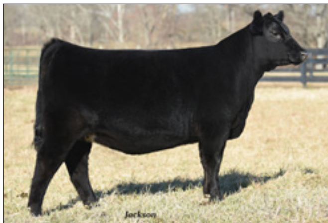
Rock Ridge Frontier Gal G16 - Lot 25