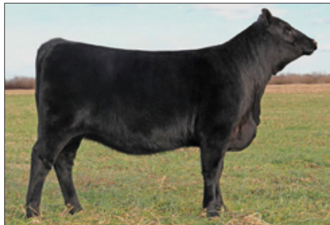
DBF Queen 8913 - Lot 30