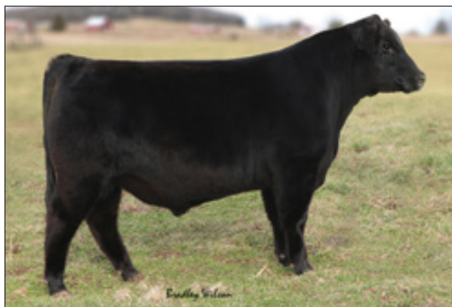
Legacy Capitalist 316 289G - Lot 46