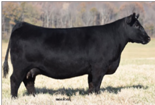
Burks 1353 Primrose 840D - Lot 31