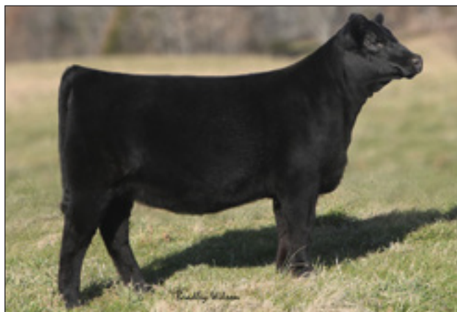
S A F ELSA 9082 - Lot 15