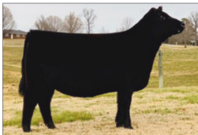
Johnson Blackcap 805 - Lot 23

This February Bismarck daughter is big bellied, big boned and super attractive through her front third. This one will make a nice show heifer if you should choose to go that route, but her most valuable days will be in production! The dam is a 10-year-old Net Worth daughter that has had a quality calf every single year. Putting Bismarck on that cow has made one that should produce for her new owner for years to come. With Bismarck semen getting harder and harder to find, and an outstanding producer on the bottom side, take note here if you need to add some outstanding genetics that have stood the test of time.