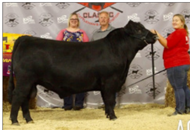
R & K OB Convoy 801 - Lot 50