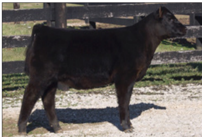
Voyager Emblynette 8789 - Lot 1