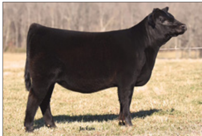
Burks 518Y Rosebud 970F - Maternal sister to Lot 7.

A daughter of our foundation Rosebud donor who is a flush sister to some of winningest and most proven donors in the country. A maternal sister, Burks 518Y Rosebud 970F, was a reserve division champion in the 2019 Sweepstakes and a $3500 selection for Harvey Cattle Co & Kurt Fischer of Paris, MO. A total of four maternal sibs to 144G have been featured through previous KY Sweepstakes and have sold for over a $6,000 average. 144G is sired by the hottest showing sire in the breed today, Conley Express 7211, whose progeny have been top sellers & banner getters in 2019 & 2020. BW 68 lbs.; OCV View her picture and video on the For Sale page at burkscattle.com closer to sale day.