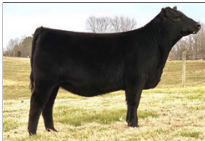
Johnson Elba 912 - Lot 17

• A powerful daughter of R&K OB Conversation 601. He was the Intermediate Division Champion Bull at the 2017 National Junior Angus Show and Supreme Champion Bull at the 2017 Kentucky State Fair. She is long fronted, long hiped, big ribbed with lots of power. The first daughter out of 601 was Division Champion at the 2019 Kentucky State Fair. The dam of Lot 16, Champion Hill Georgina 8803, is an outstanding Hesston daughter that was a Division Champion at the 2016 Kentucky State Fair. If you're looking for one that can compete, this one will be strong in the summer division.