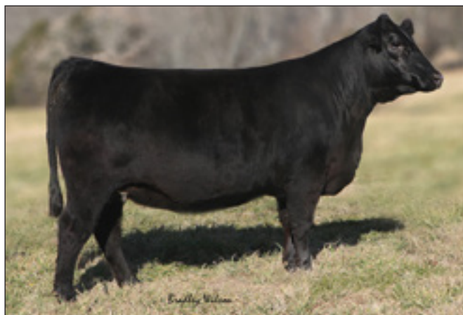
S A F Elba 8064 - Lot 37