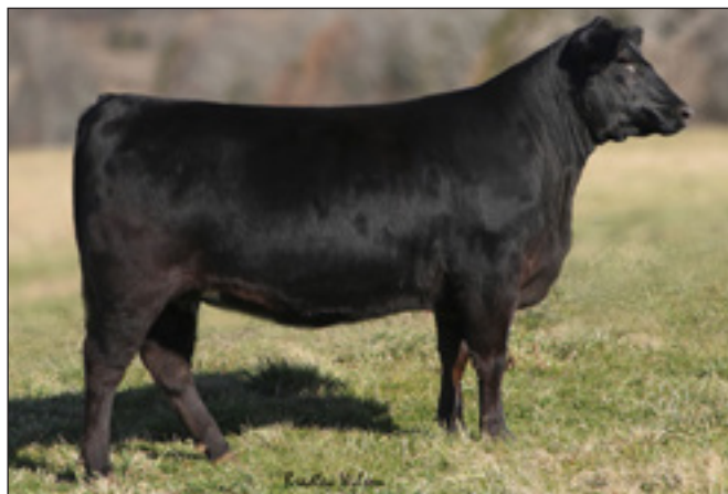
S A F Polly 8060 - Lot 38