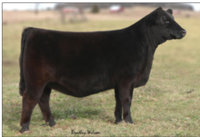
Legacy Dixie Erica 285G - Lot 26

• Wow! This heifer has been a farm favorite and eye catcher from the time she arrived. She is a very complete and powerful individual that is sure to have a promising show career. Her eye appealing and very productive dam has an ideal udder and recorded a weaning ratio of 129 on her first calf. The granddam, EXAR Frontier Gal 1405, has consistently ranked in the top 10 for ROV Show Dam of the Year for the last four years.