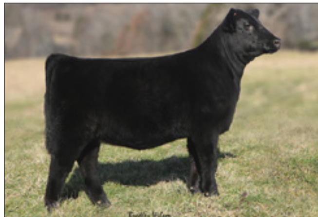
SAF Barbara 9102 - Lot 13