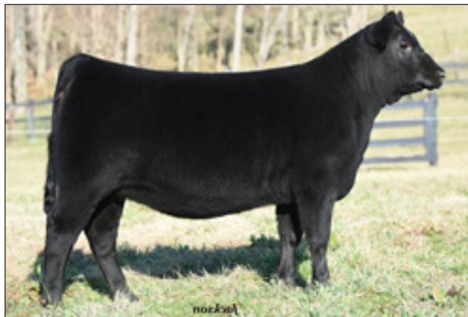
TAF Miss Countess 1909: Lot 11