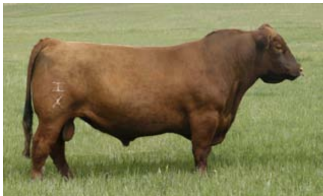
MGS to Lot 6 HXC Jackhammer 8800U