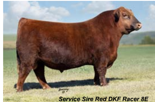
Service Sire Red DKF Racer 8E