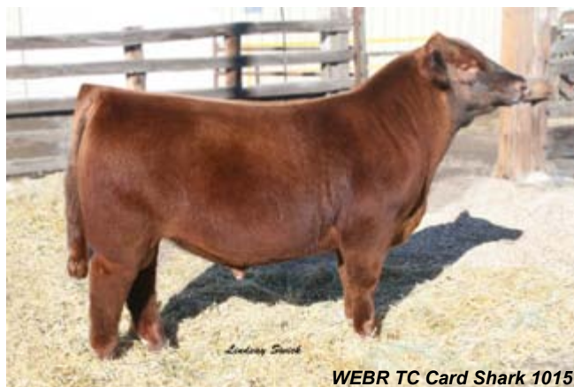
WEBR TC Card Shark 1015

Riggins Anne 903 has been the poster child for the Shuter Family Cattle Company program for many years. As an 11 year old cow, she is still as beautiful and powerful as she ever was. Cardshark is also an ageless wonder, with numerous people around the country continuing to use him to crank out top quality cattle. These embryos are full sibs to TWO NAJRAE Champion Females. The Meier Family's female was many time champion as was the female that the Murphy Family raised. Anne has placed progeny in many herds across the country and here is your chance to add her genetics to your herd.