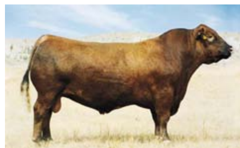
MGS LMAN King Rob 8621

Guarantee 1-90 day pregnancy if implanted by a certified tech