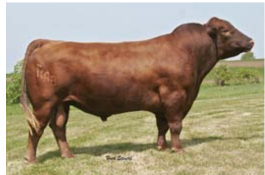
Sire to Cow Lot 39 Bieber Makin Hay 9913

B169 has been a consistent producer for us stemming from the great Damar herd. Her bull calf has a tremendous epd profile and she sells bred back for another great calf