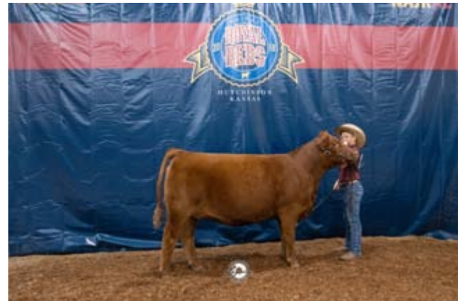
EAR Copper Lass 170 Daughter

JMMQ Wild Card 929G (#4211190) born 9/26/2019 AI 12/04/2019 to Red U2 Malbec 195D (#3721545) AI 12/27/2019 to AHL Flashback 446B (#1667094) P.E. 12/29/2019-02/15/2020 to Cedar Ridge Falcon 831F (4074744)