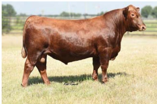
Sire to Heifer Calf C-Bar Big River