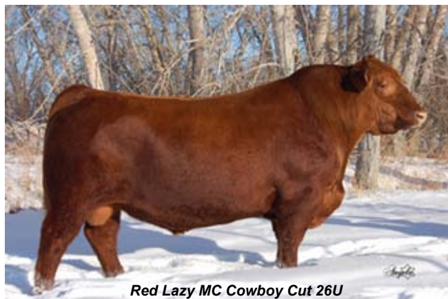
Red Lazy MC Cowboy Cut 26U