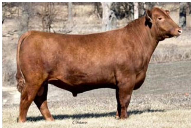
Service Sire to Lot 42 LSF MEW X-Porter 6695D

Here is another cow that comes straight out of the heart of the herd. This is one of those no miss type of cows she's always produced really could calves no matter how she was mated. This heifer calf one her side is sired by one of our up and coming herd sires SHADY'S CONQUEST D143 we are really liking this bulls calves and this heifer is no different.