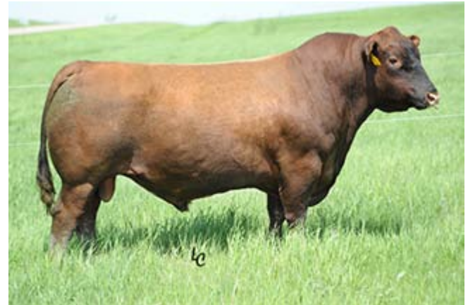
Sire to Lot 43 Bieber Rouse Samurai X22

If you are looking for a deep bodied, stout boned cow, you may have an interest in this Samurai daughter. This female is long spined as well as thick, and has been one of our most productive cows on the farm. She is strong maternally and you will appreciate that with her calf at side. This female is a genetic and phenotypic powerhouse with a strong, well made calf by her side. The cow comes halter broke with a great disposition. Cow will sell open, and calve in the first of February.