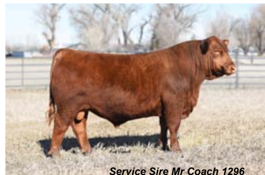
Service Sire Mr Coach 1296