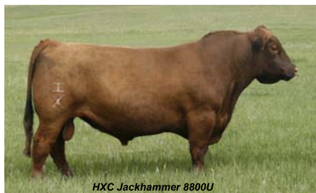
HXC Jackhammer 8800U