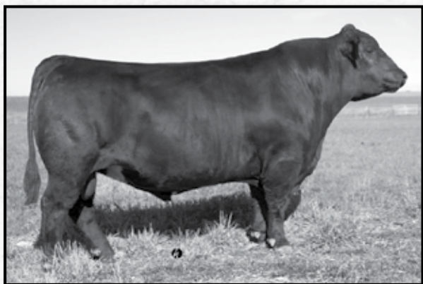
Hook's Broadway • Sire of lot 45