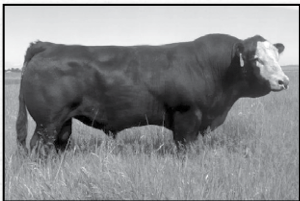
Big Casino • AI service sires to lots 57 – 59