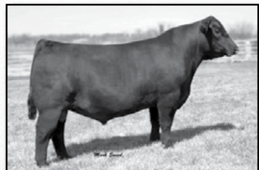
SAV Brilliance • Sire of lots 76 & 78.