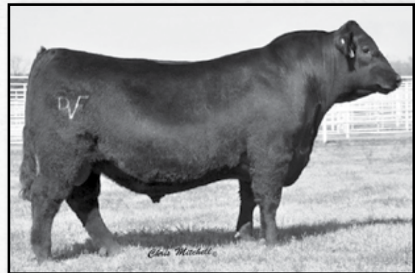
Deer Valley Unique • AI service sire of lots 27, 28, and 30.