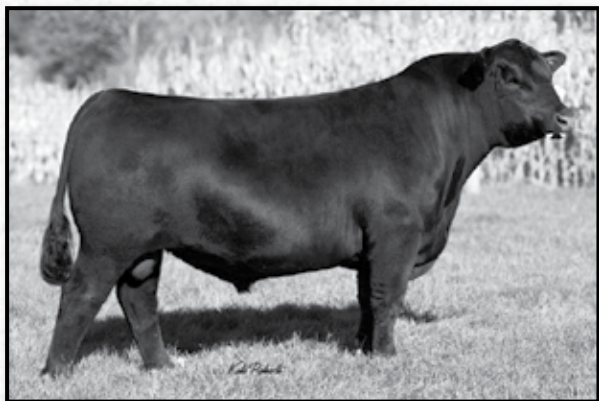
ACC Bourbon • Sire of Lot 6