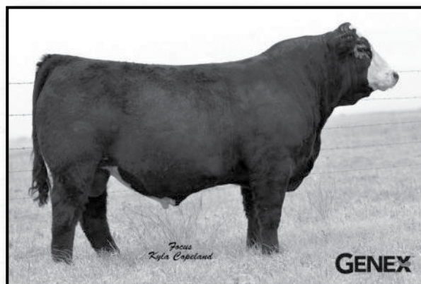
Winc Live Ammo • Sire of lot 25