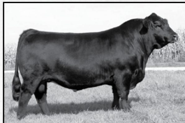
Uno Mas • Al service sire to lots 37 and 38