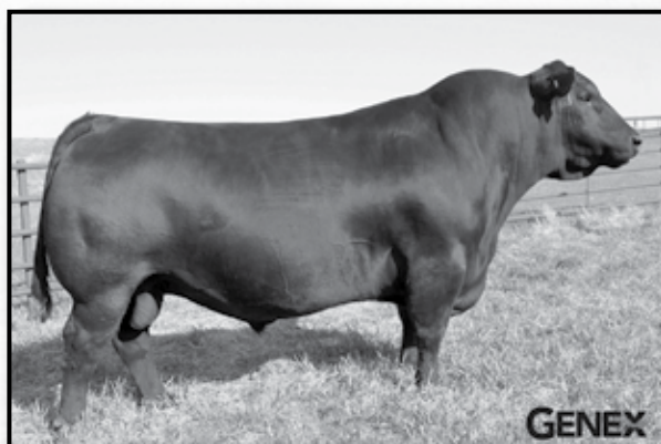
SAV Resource • Sire of lot 21