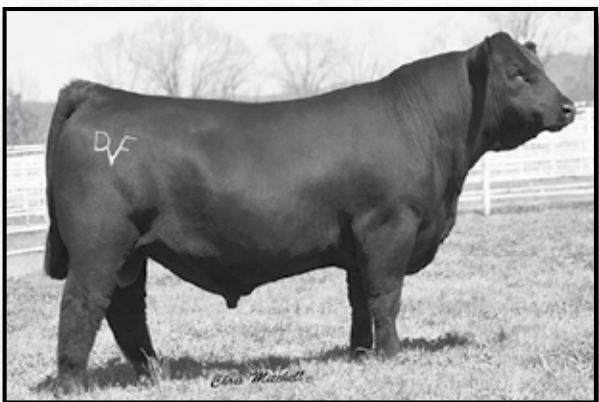
Deer Valley Growth Fund • AI service sire to lot 46