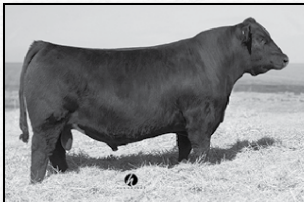
CCR Boulder • AI service sire to lots 22 and 23