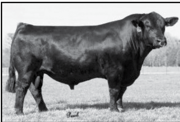
GWS Ebonys Trademark 6N • Sire of Lots 11 and 12.