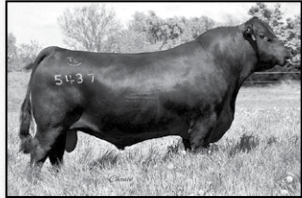
Tex Playbook • The popular and proven sire of lot 1