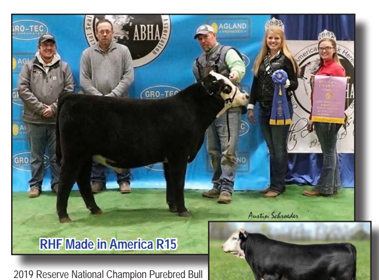
Reference Sire of Lot 18 Embryos