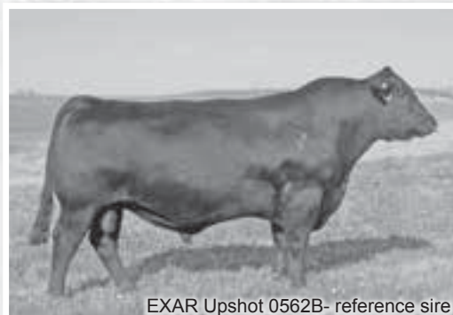
EXAR Upshot 0562B- reference sire