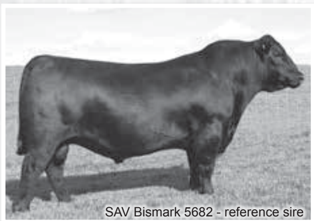
SAV Bismark 5682 - reference sire