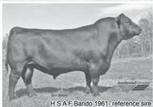
H S A F Bando 1961- reference sire