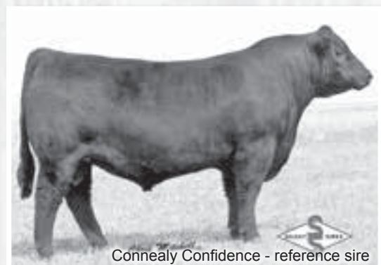
Connealy Confidence - reference sire

Tag 151, 152 & 155 - 42X is backed by Circle T and Neal Bros. genetics