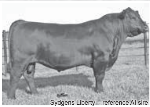
Sydgens Liberty - reference AI sire