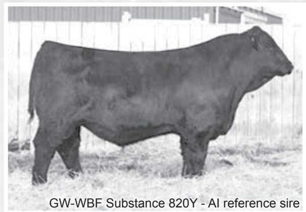
GW-WBF Substance 820Y - AI reference sire

CED 5 Consigned by... Springdale Woods Farm BW 1.1 Bred Heifer • Angus WW 37 BD 8/29/13 • AAA# 17640349 • Tattoo 1332A YW 68 CEM 12 B/R New Design 036 Milk 18 B/R New Frontier 095 Marb RE White Fence Pride H1 FAT N Bar Emulation EXT SW 27.55 R&K SWF Emulous 632 SF 15.47 B & L Miss Emulous 4131 SG SB • Bred AI to GAR Prophet , AAA# 16295688 due 3/21/16