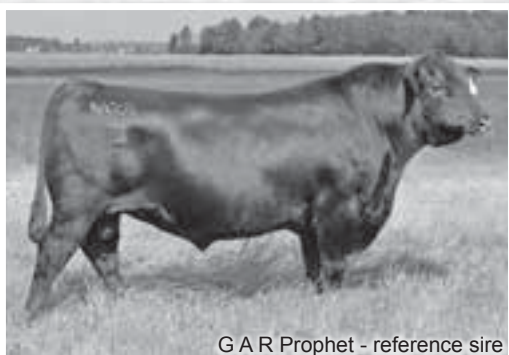
G A R Prophet - reference sire