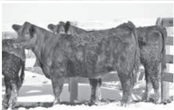
Hamilton Cattle Co. Heifers