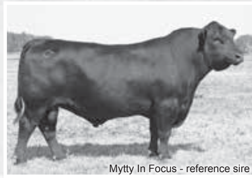
Mytty In Focus - reference sire