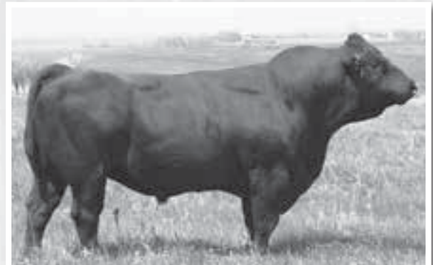
Ellingson Legacy M229 - reference grand sire