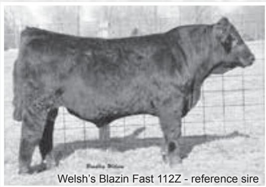
Welsh's Blazin Fast 112Z - reference sire