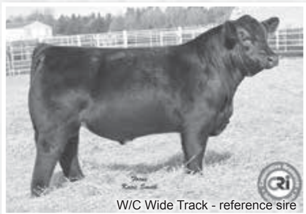
W/C Wide Track - reference sire

CED BW WW YW CEM Milk Marb RE FAT SW SF SG SB Consigned by... Springdale Woods Farm Bred Heifer • Angus BD 8/19/13 • AAA# 17638564 • Tattoo 1316 G D A R Traveler 044 Connealy 044 062 Hallie of Conanga 6940 G A R Predestined SWF Predestined Princess 116 SWF Princess 1416 • Bred AI to GAR Prophet , AAA# 16295688 due 4/11/16