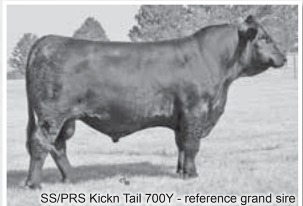
SS/PRS Kickn Tail 700Y - reference grand sire