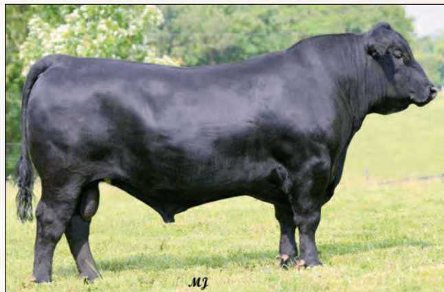
Ellingson Secretary 2011 - Sire of Lot 48.