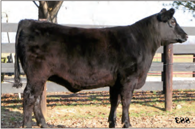
SFA Lady Dividend 883 - Lot 34