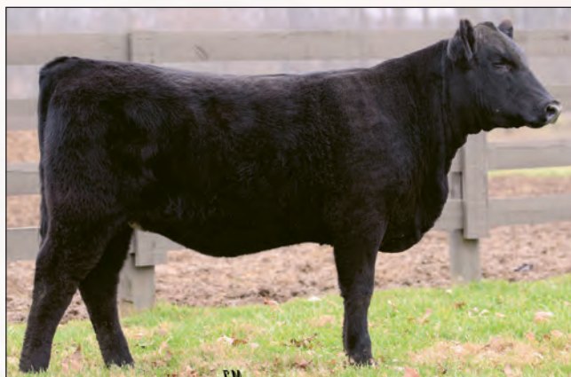
AK's Safeguard Abigale Ava - This Safeguard daughter sells as Lot 15.

Daughter of the ABS/ORlgen sire, BV Pinpoint 1045. Pinpoint has seen wide use across the country and shows progeny ratios of BW 99, WW 99, YW 101, IMF 101 and RE 100. Dam shows an outstanding progeny record on five head of BW 100, WW 103, YW 104, IMF 112 and RE 109 while maintaining a calving interval of 365.