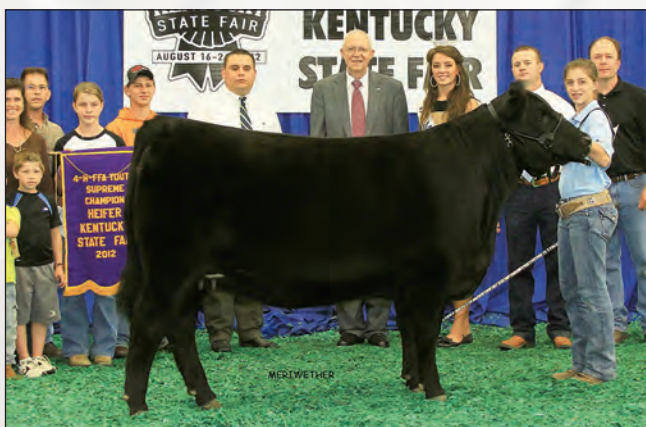
H G R Miss Stronger - Dam of Lots 6 and 8.