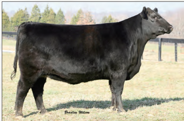
CHF 9535 Liberty Belle 1225 - Lot 31