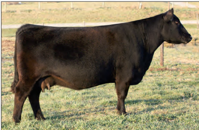
Champion Hill Georgina 7338 - Lot 33