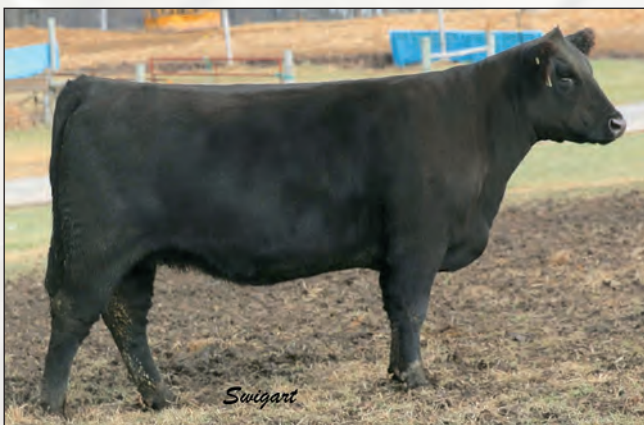
BRC Barbara Lass 1203 - Lot 40

• BRC Blackbird is one massive female with lots of style to her that is out of one of the most productive donors at Blue Ridge Cattle. At 11 years of age her donor dam is still a tremendous productive female. 130 is a maternal sister to the heifer that Blue Ridge had at the 2014 Sweepstakes Sale that was a tremendous production female. Serviced 12/6/14 to TEN X.