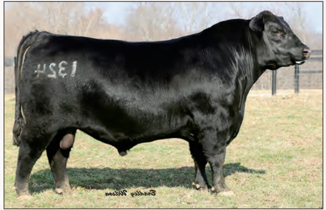
CHF 6099 C C & 7 1324 - Lot 51