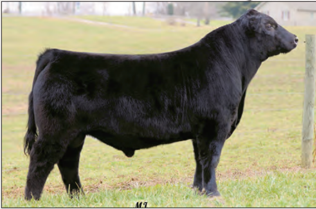
Johnson Poker Face - Lot 50