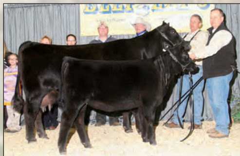
Grand Champion Cow-Calf Pair was awarded to Champion Hill Elba 7331. Buckner & Jeffries, Canmer, KY, own the September 2009 daughter of S A V Pioneer 7301. A September 2013 heifer calf sired by TC Aberdeen Ace 966 completes the winning duo.