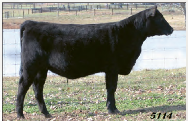
SFA Forever Lady 5114 of MC - Lot 11