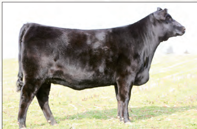
S A F Jilt A050 - Lot 29