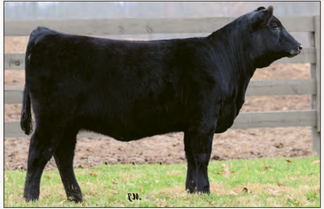
Heritage Angus Valley 436 - Lot 12