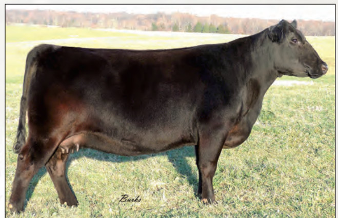
Champion Hill Emblynette 6732 - Dam of Lot 4.