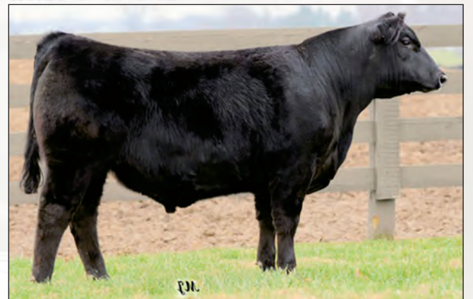
MJ Motivation 1429 - Lot 44

An outstanding son of Consensus from the Morehead State program. Performance Data: BW 90, WW 679, ratio 116, WDA 3.04. EPD %Rank: Milk and $F 10%, YW 5%, WW 3%. GENETIC IMPROVEMENT QUALIFICATIONS: TERM, HP.