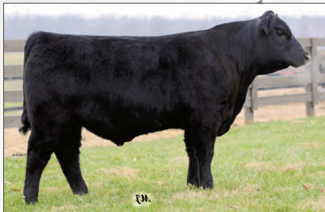
Heritage 7008 Ten X 427 - Lot 42