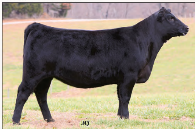
Johnson Lady 318 - Lot 26