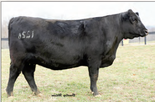
CHF 8313 Forever Lady 1226 - Lot 38