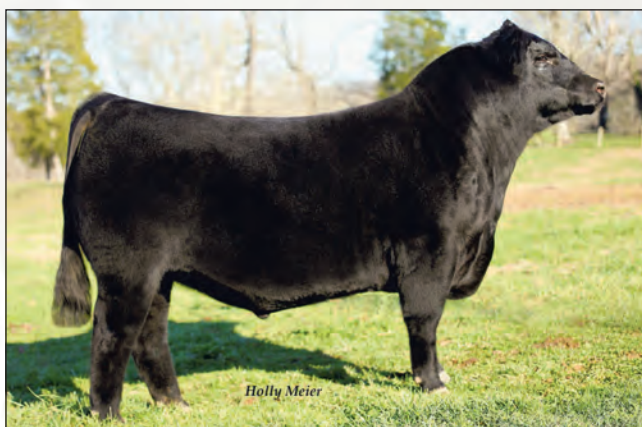
Gambles Safe Bet - Sire of Lots 8 and 49.