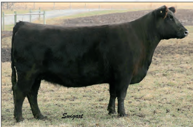
BRC Blackbird 130 - Lot 39

• She is a Royal Flush daughter out of our best young donor SydGen Forever Lady 8313. She is bred to calve in mid-January to SydGen C C & 7 and will show as a cow/calf. She has all the characteristics of the Royal Flush line, large-framed and roomy, but well-made and nice to look at as well. She sports performance data consistently in the top 15% of the breed and caps it off with a $B of +115.69. A great donor cow prospect!