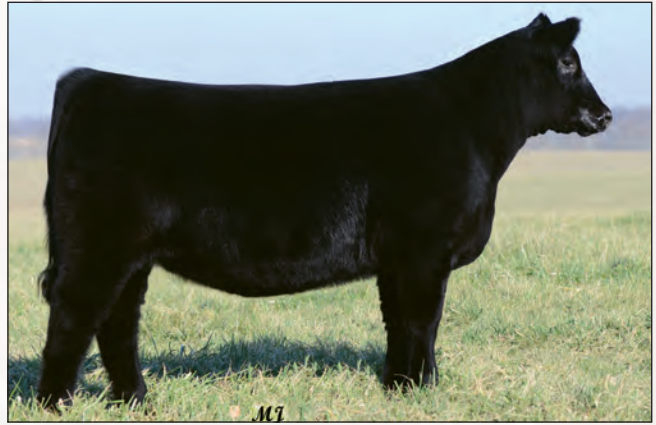
Burks 8515 Princess 701B - Lot 19