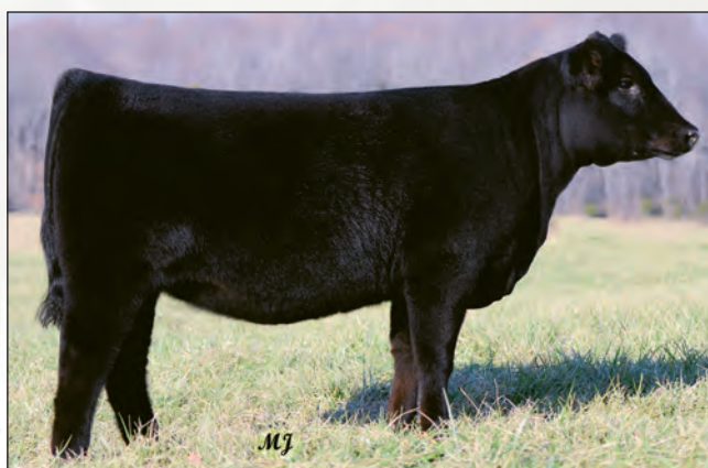
Burks 518Y Rosebud 703B - Lot 18

We could not dig deeper into our replacements than 703B, she is exactly what we expected when we mated Tryon, a full brother to Lutton, to our Rosebud females. Full sisters to her dam work and consistently produce champions for Cherry Knoll Angus and APS Angus. This striking beauty is sound as a cat with a soft tear drop rib shape, and she is powerfully constructed from end to end. 703B has one of the sweetest attitudes we have ever experienced in an Angus female, which would make her an excellent project for a younger Junior member. Genomically-enhanced EPDs pending 50K test. View her YouTube video at "Burks 518Y Rosebud 703B". Reserve the right to one future flush. Minimum of four good embryos. Birth Wt. 68 lbs., Adj. Weaning Wt. 606 lbs., ratio 102. OCV