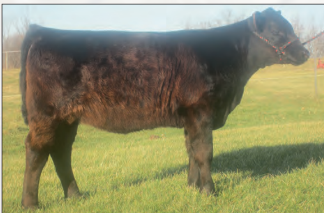
CTD/APS Rose - Lot 2