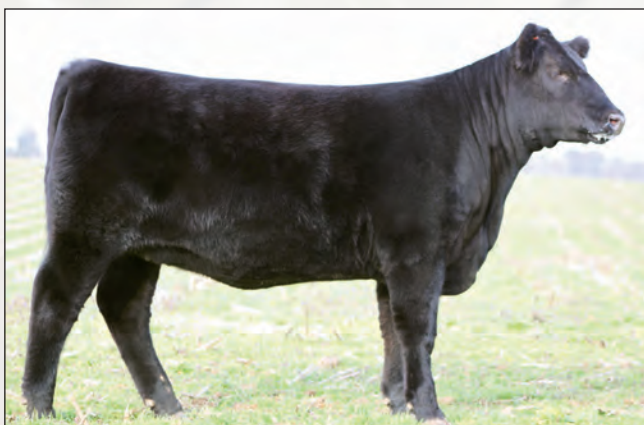
S A F Forever Lady B037 - Lot 25