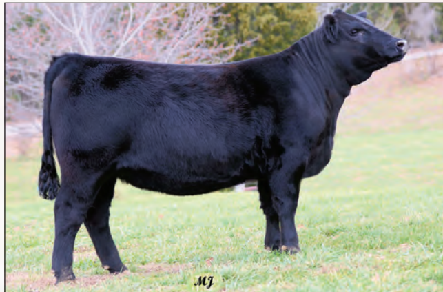
Johnson Blackbird 311 - Lot 28