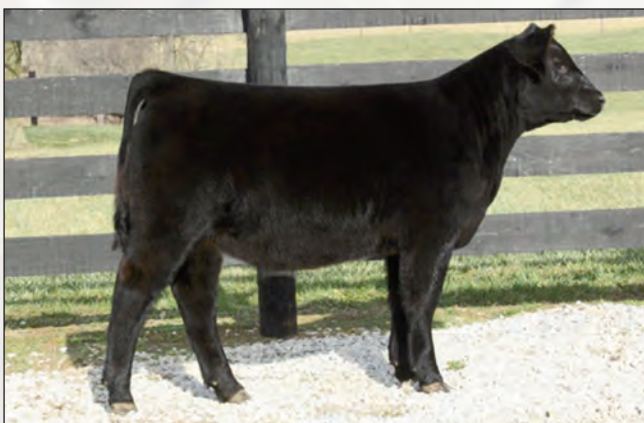
Voyager Georgina 734 - Lot 33A