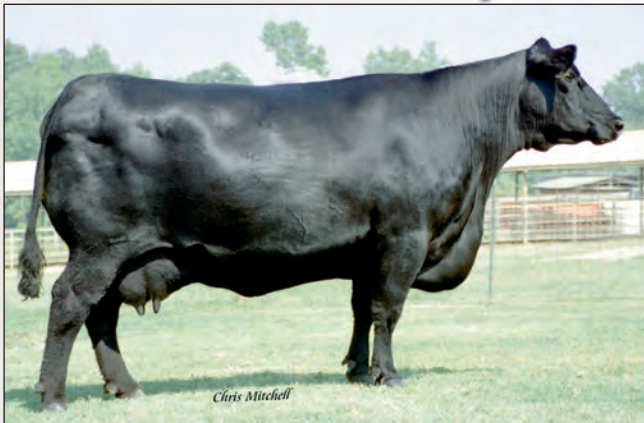
SVF Forever Lady 57D - Lot 32 is a direct maternal descendent of this proven donor.